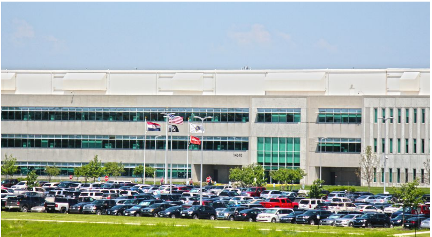
Kansas City National Security Campus, May 2019

The very same politicians, who had railed about the hazardous hulk on Bannister Road, were out in full force at the groundbreaking on Botts Road on August 22, 2014.