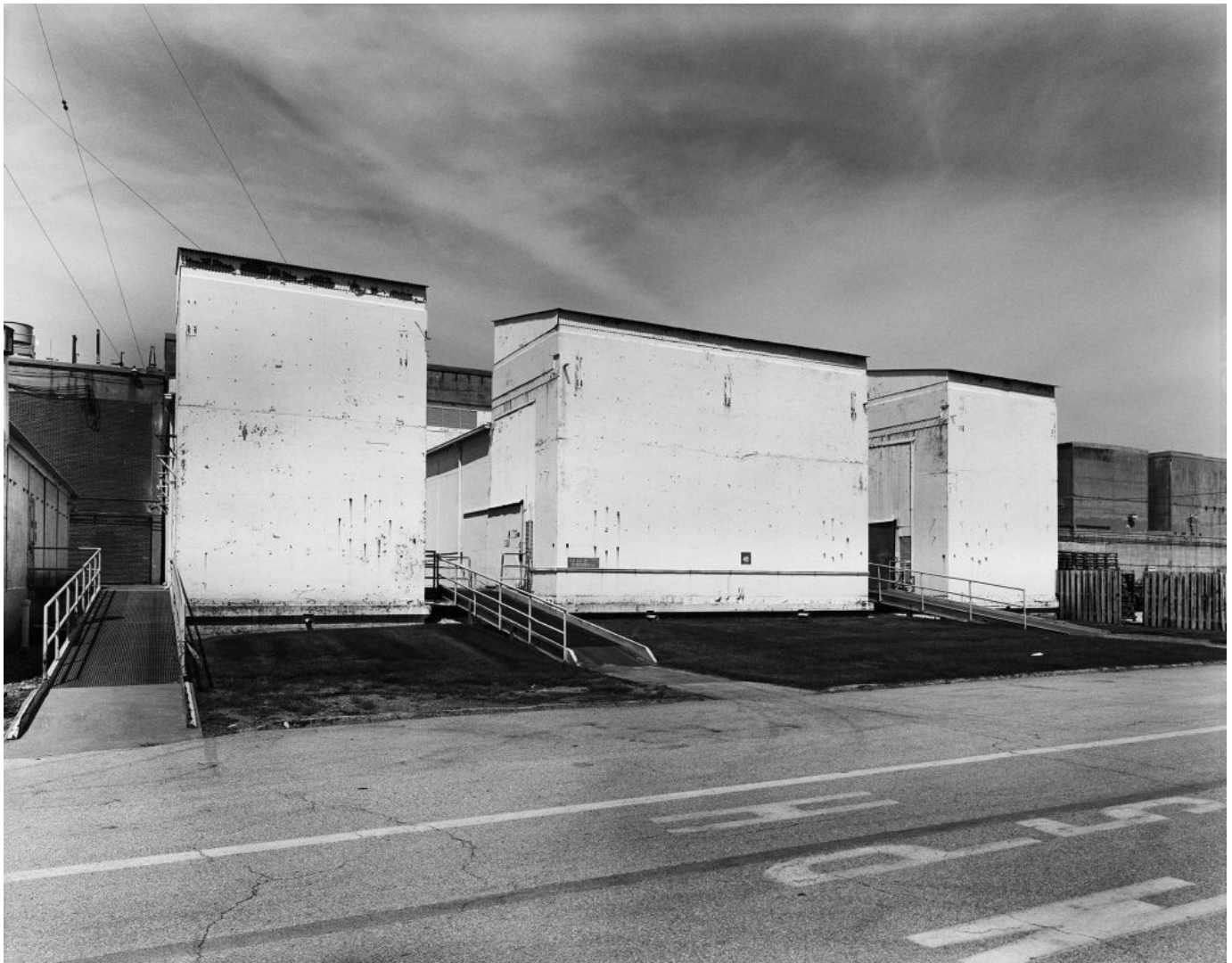
Test cells at the Kansas City Plant, 2013