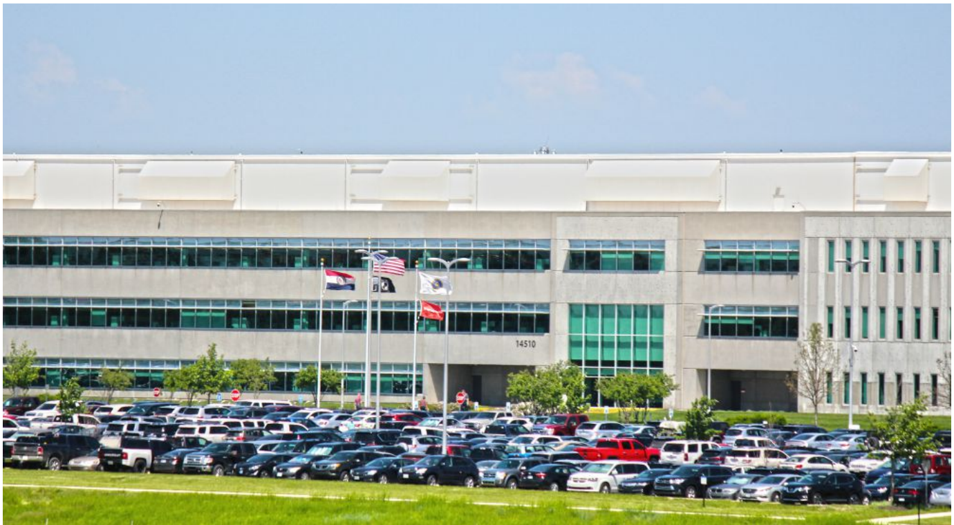
Kansas City National Security Campus, May 2019

The very same politicians, who had railed about the hazardous hulk on Bannister Road, were out in full force at the groundbreaking on Botts Road on August 22, 2014.