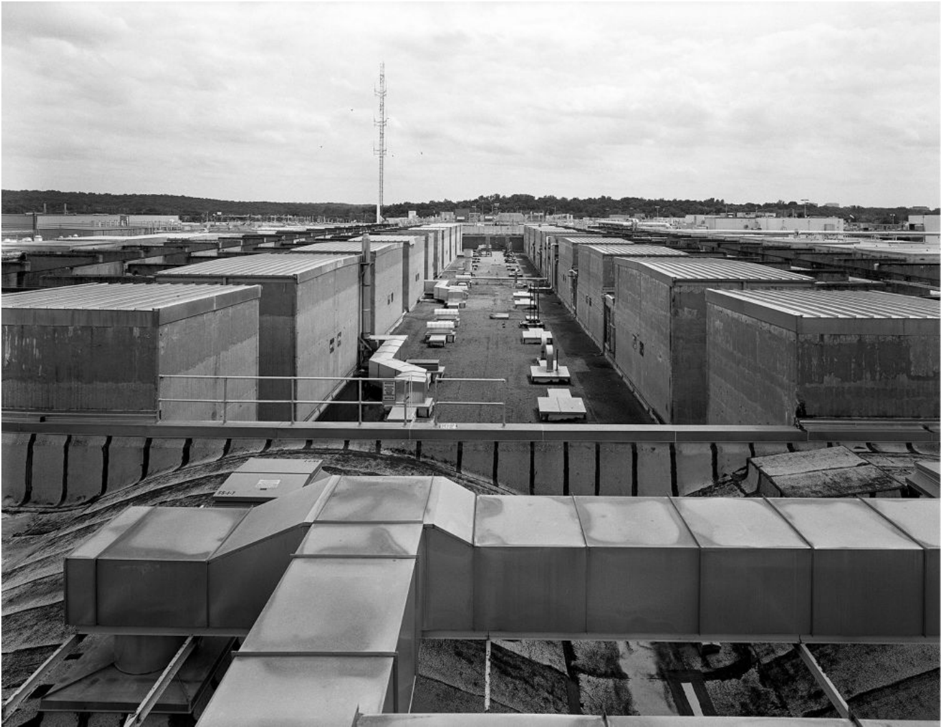
Roof view of Kansas City Plant's Main Manufacturing Building, 2013