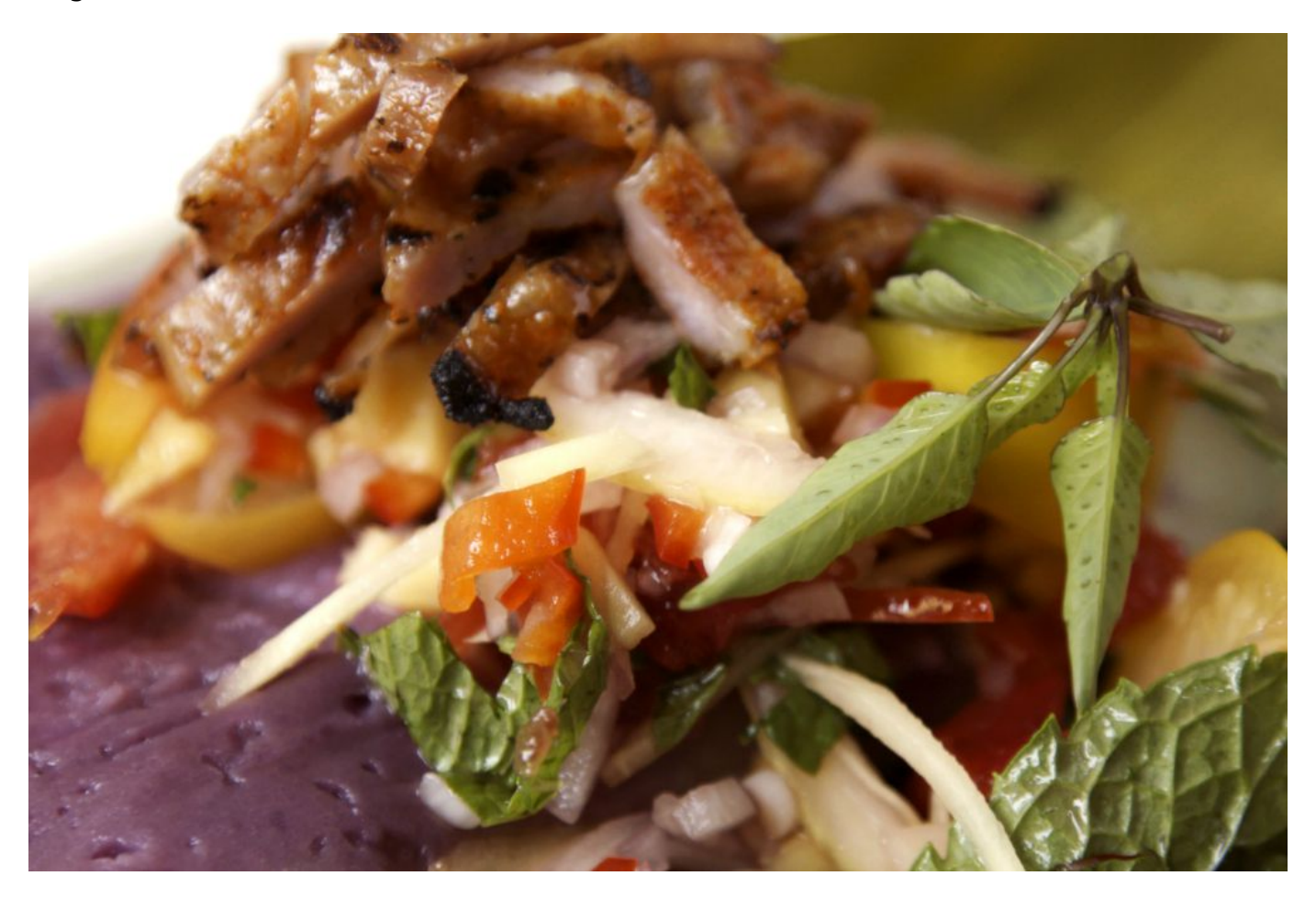
An ube tamale by Romy Dorotan, from "Ulam: Main Dish"

because it is perceived to be too aberrant, unworthy of the mainstream Western palate. Thusly, we see Cailan unapologetically serving pork sisig , a rich sizzling plate of chopped pork face parts. And in a charming scene, Ponseca demonstrates how the dreaded street food balut , boiled duck egg with a half-formed embryo, is served proudly in her restaurant; in chorus, staff and customers echo the vendor's call that rings out in Manila's streets — "baluuuuuut!"