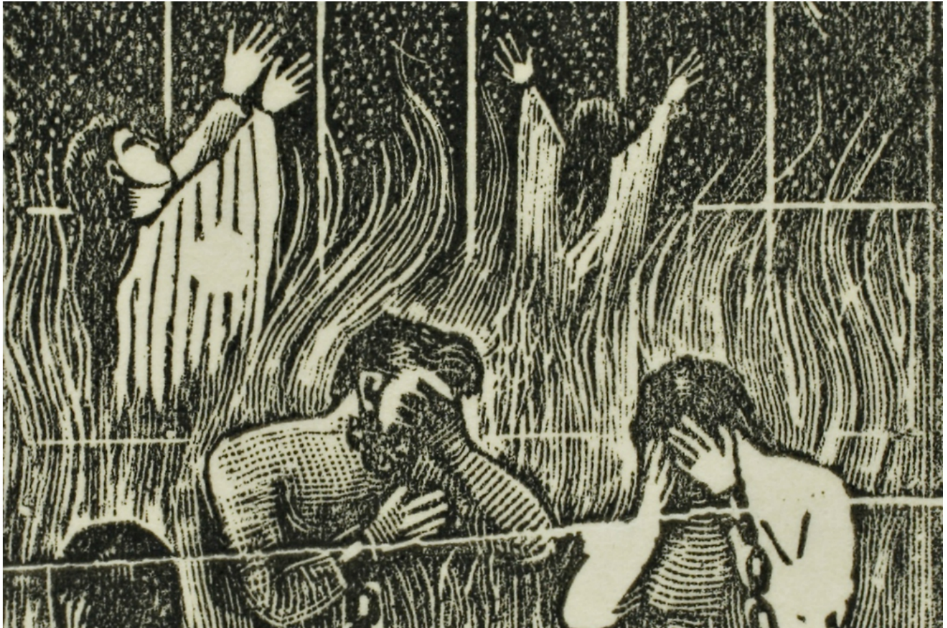
"Souls in Purgatory," detail, by José Guadalupe Posada, Mexican, 1871-1913 (Art Institute of Chicago)