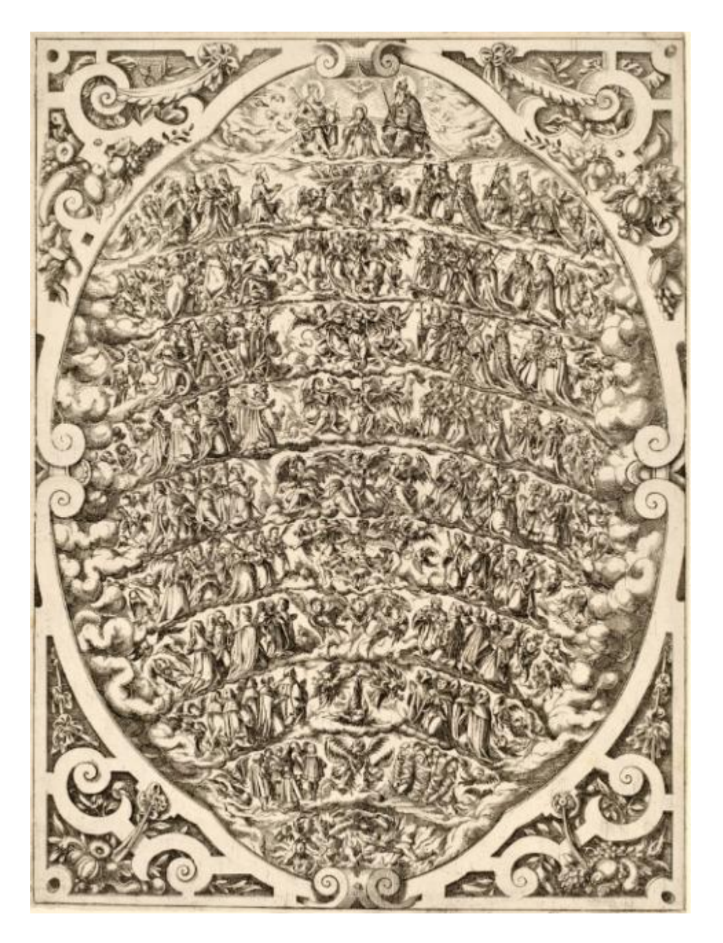
"The Hierarchy of the Heavens" (1579) by Jost Amman (National Gallery of Art)

No matter the hierarchical hands raised against the incoming tide, the future has already washed over the present. The Church, much like a family, is trying desperately to adapt to a shift in the way of life it had counted on as unchanging and virtually unchangeable. It has been torn, instead, between an attempt to return to a familiar and comforting past and an eagerness to enter the Mystery of an already present but not well understood future. Breaking cleanly out of the Middle of the Sex Abuse Crisis demands that the leaders in the Church surrender the style that made the Sex Abuse Crisis possible and, so far, its resolution impossible.