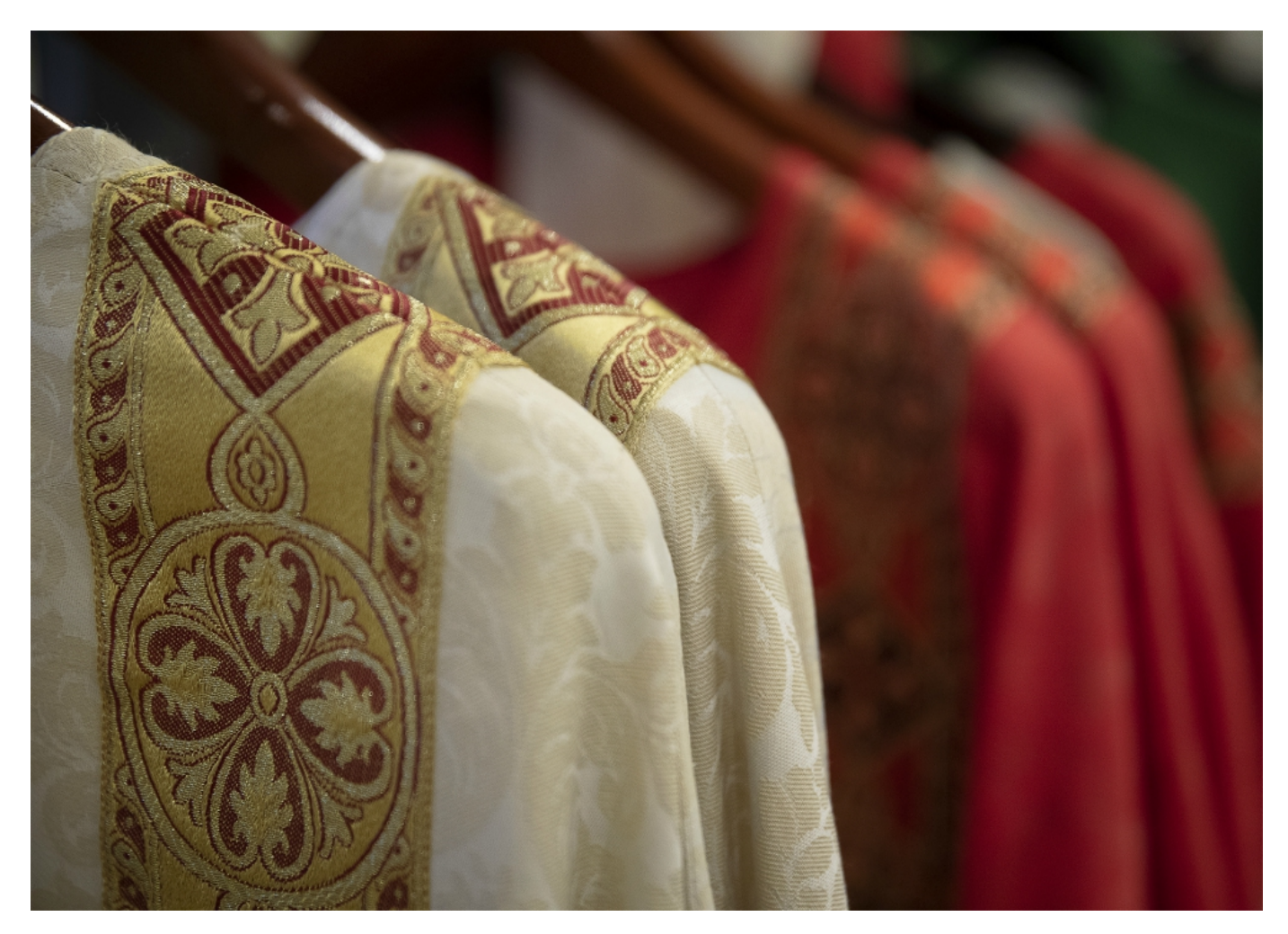
Vestments are seen in Grapevine, Texas, Sept. 19, 2018.

The clerical culture, an ecclesiastical version of an exclusive men's club, also offered enormous emotional support to priests who enjoyed good times like the most innocent of boys, but boys nonetheless, during the high period of the pre-Vatican II Church when clerical culture flourished. This camaraderie was not unhealthy and was, in many ways, what made celibacy a bearable condition for them. It did not, however, advance the inner growth of those who were psycho-sexually immature. They were good boys, in good standing in the wonderful then highly honored, privileged and excuse-endowed Clerical Culture.