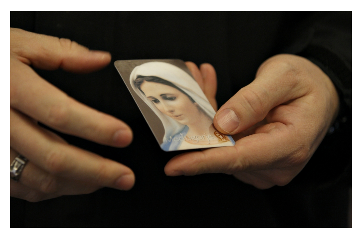
A priest holds an image of Mary in Medjugorje, Bosnia-Herzegovina, in 2011.