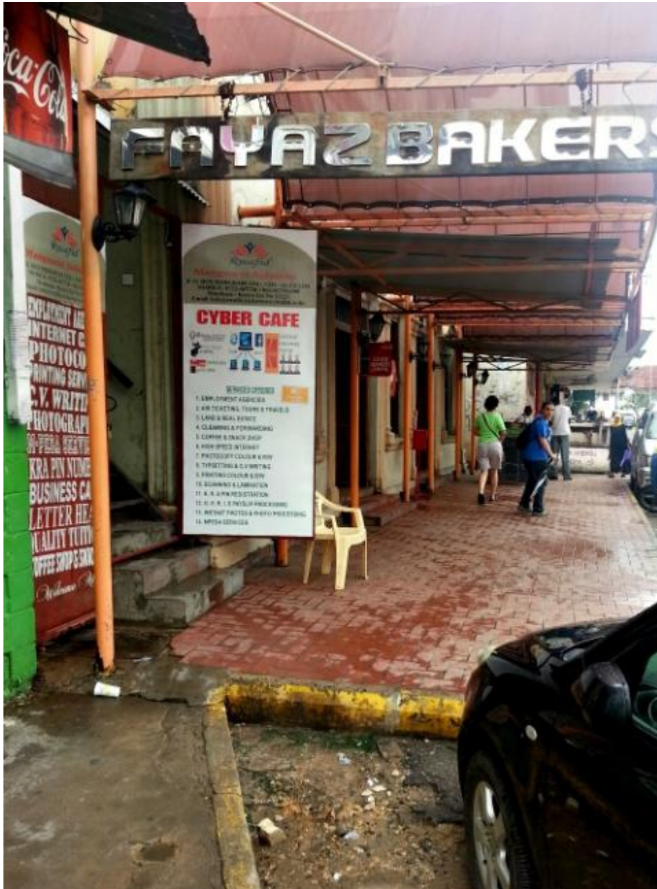
A cyber cafÃ© is seen in Mombasa, Kenya, in 2013.