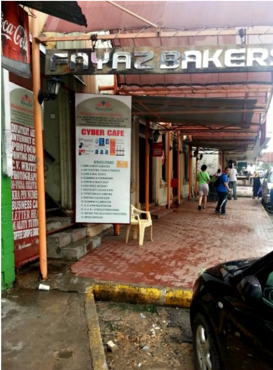
A cyber café is seen in Mombasa, Kenya, in 2013.