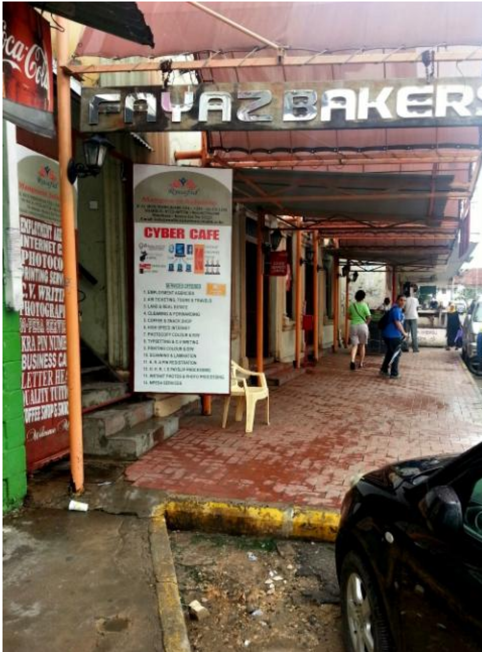
A cyber caf   is seen in Mombasa, Kenya, in 2013.