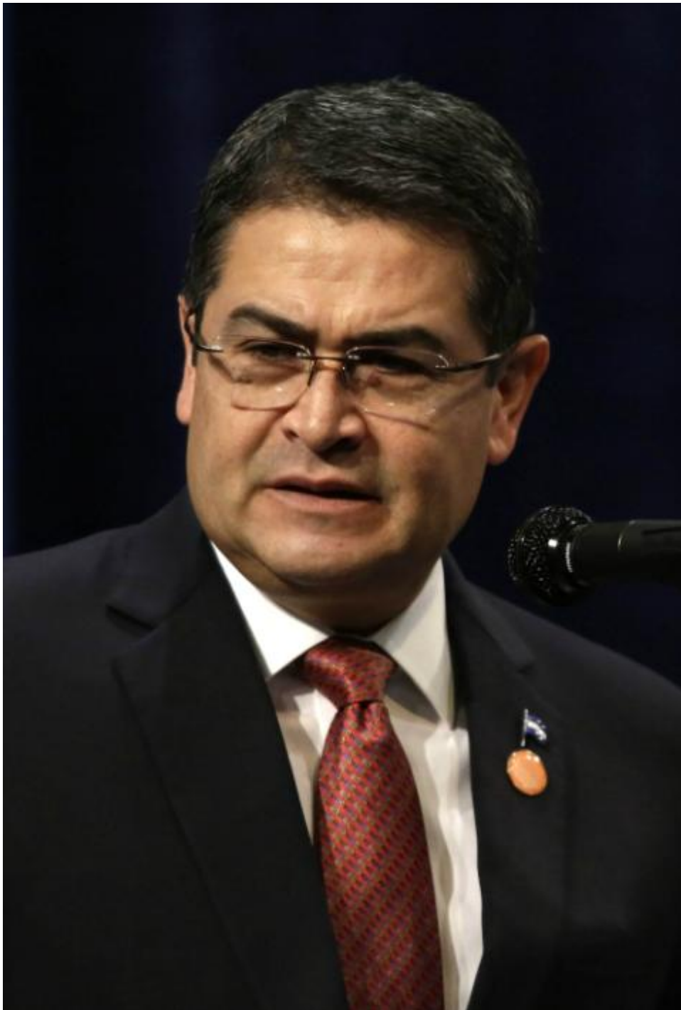
Honduras President Juan Orlando Hernández