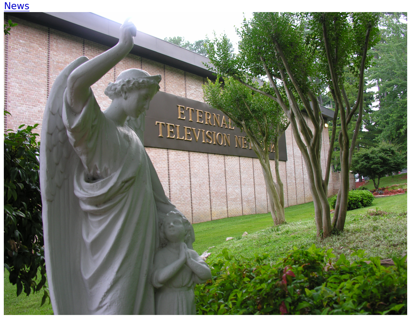
The front of the EWTN studios in Irondale, Alabama.