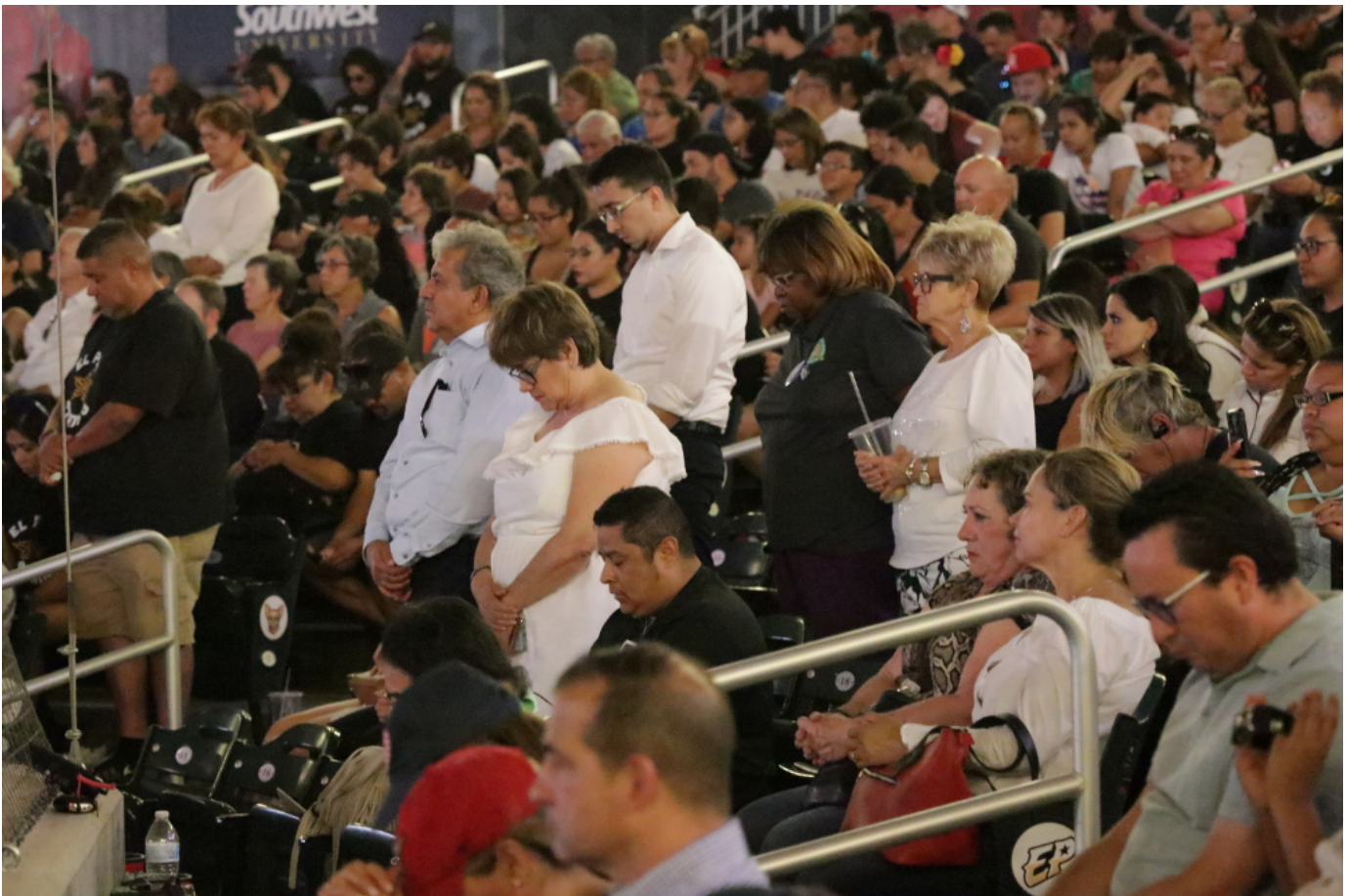
Participants bow their heads in prayer at an Aug. 14 memorial held at Southwest University Park in El Paso.

"I've seen over the years as we've reached out to waves of migrants that come through El Paso, how there is a tremendous spring of solidarity to draw upon in this community," he said. "The effort to get volunteers and donations to help us receive migrating people with dignity is not especially difficult here. What El Paso is dealing with now in terms of migrants, solar energy, and water consumption is what most communities will be dealing with in coming years. The response is something to emulate."