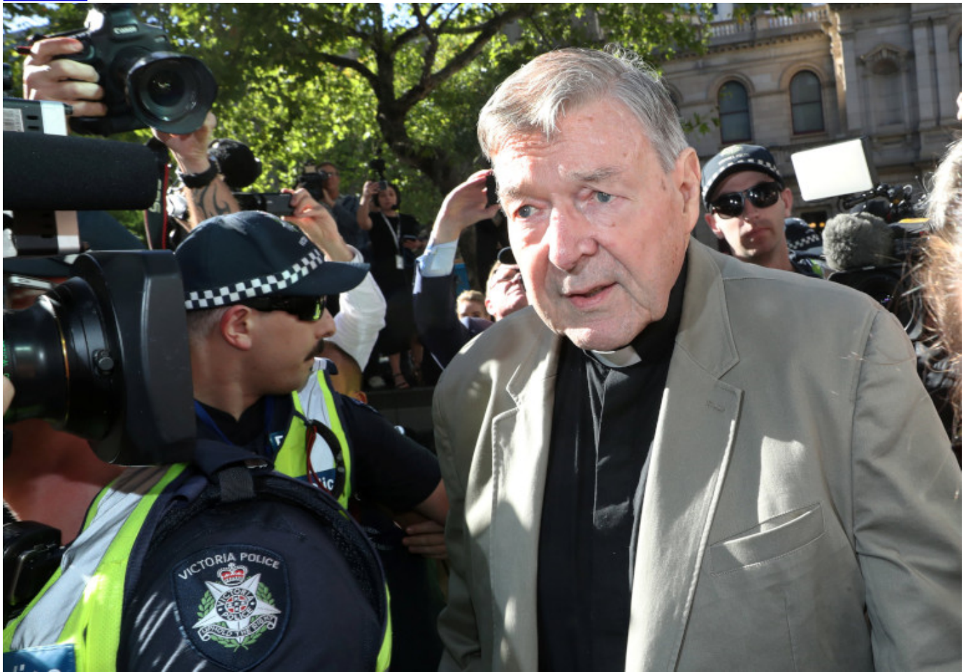
Cardinal George Pell arrives at the County Court in Melbourne, Australia, Feb. 27, 2019.