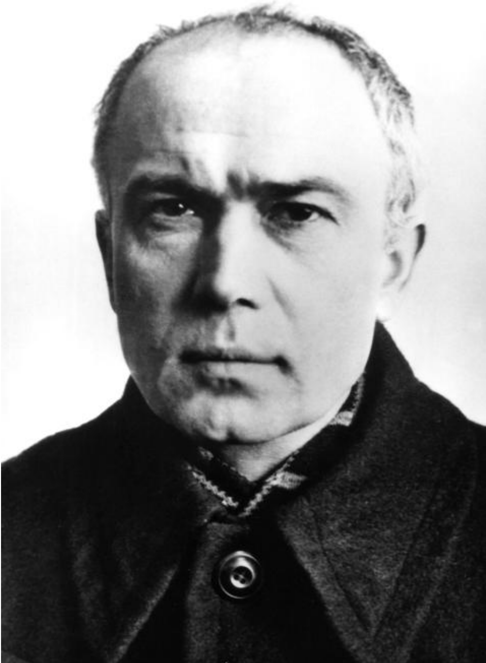
Father Maximilian Kolbe is pictured in an undated black-and-white file photo.

"All wars have direct and indirect consequences," said Schick. "The direct consequences are the deaths of soldiers and civilians, destruction of cities, villages and entire regions. Thus many human relationships are shattered and many souls are wounded."