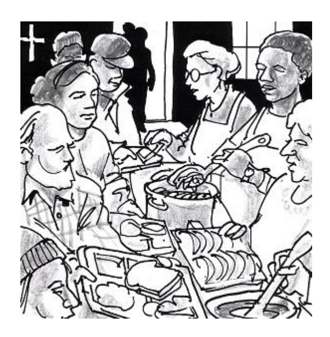
"Everyone who exalts himself will be humbled" (Luke 14:10).

Jesus' critique of table protocols was really an attack on the social networking of his culture. The only way to rise within the hierarchy of important friends was to first be invited by someone, then to reciprocate your way up the ladder of class and status to take your place among the elites.