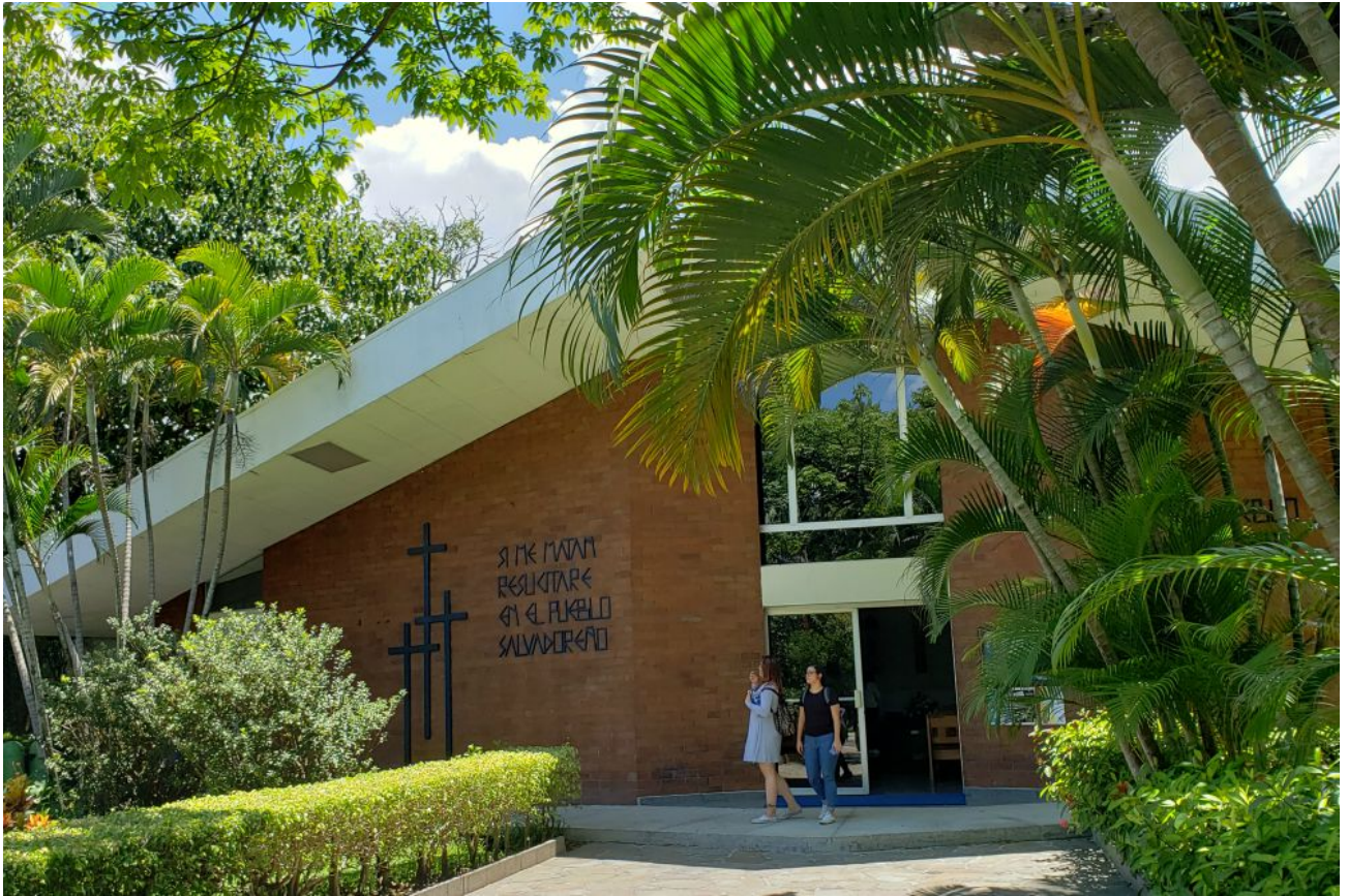
The campus chapel at the University of Central America in El Salvador, commonly known by the acronym UCA