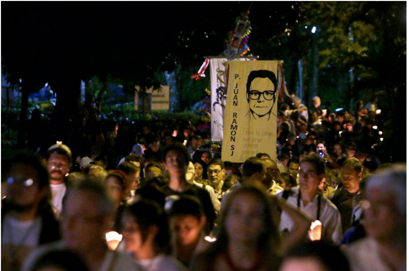
Salvadorans take part in a procession Nov. 15, 2014, at Central American University in San Salvador, El Salvador, to commemorate the killing of six Jesuit priests and two women by the Salvadoran military 25 years ago.