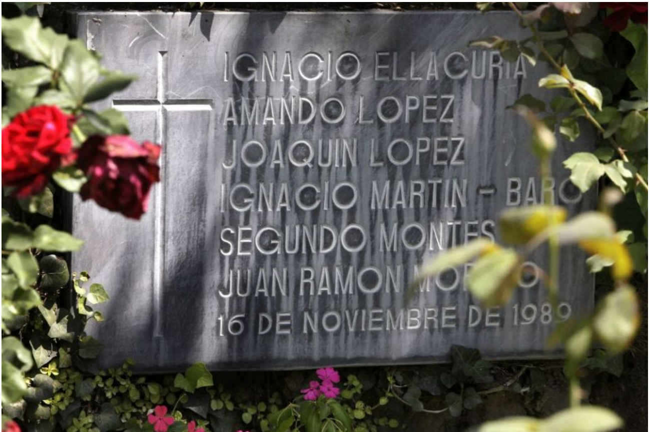
A stone bearing the names of six Jesuits massacred in 1989 is seen at Central American University in San Salvador, El Salvador, Nov. 16, 2009, the 20th anniversary of their deaths.