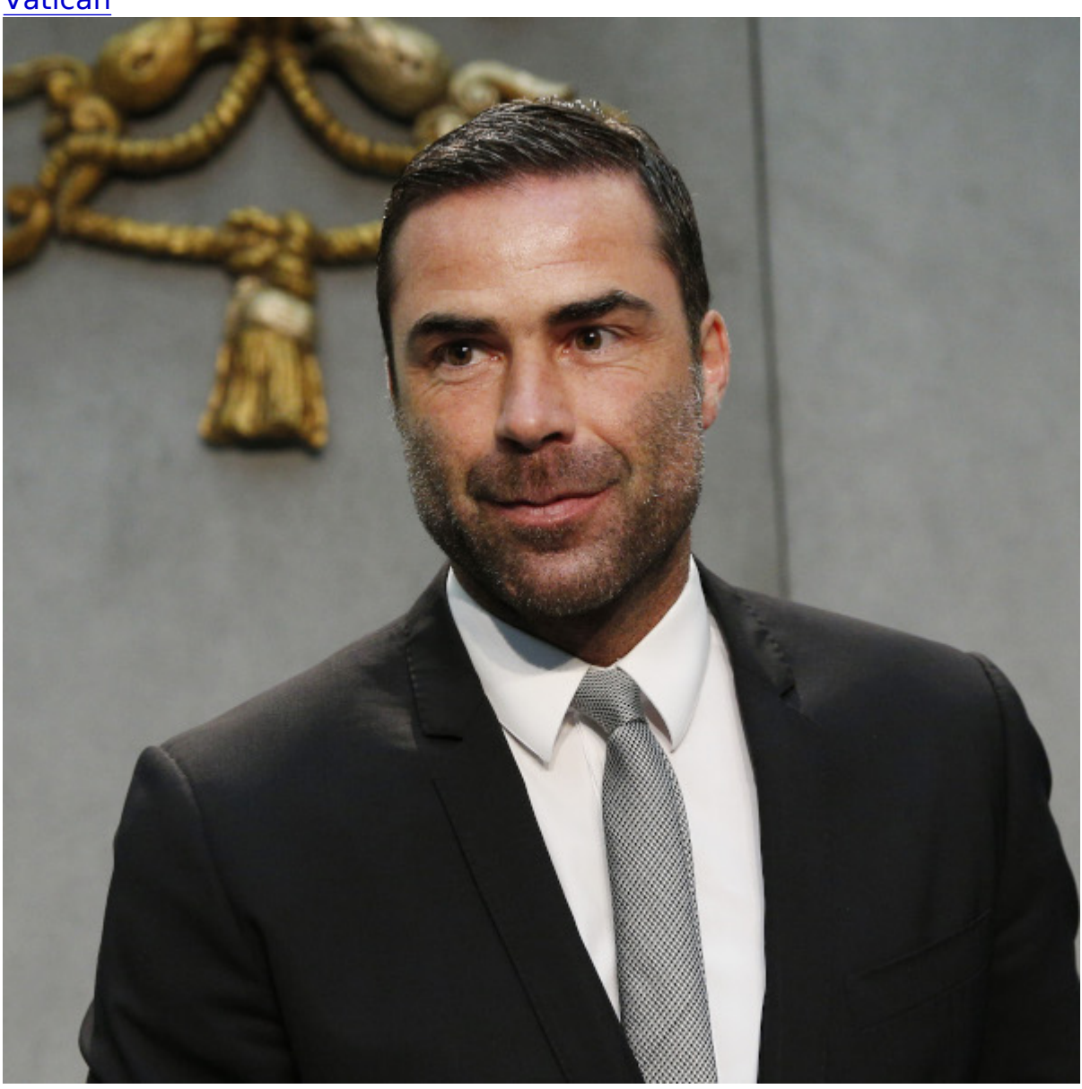
Rene Brulhart at a Vatican briefing in 2016.