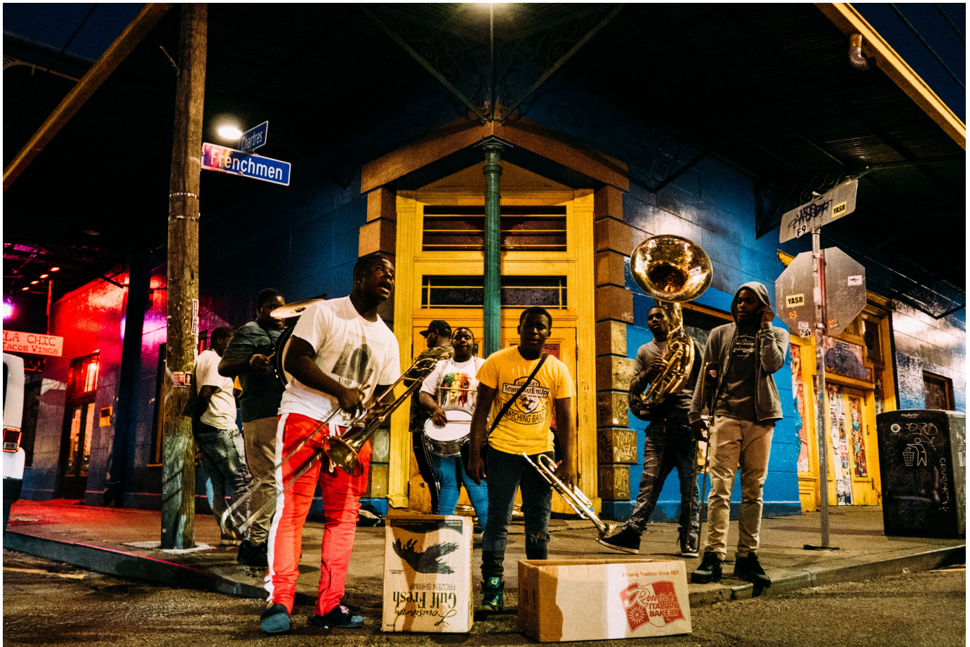
A street band in New Orleans

Foreward Reviews termed the book "a hypnotic biography of a unique American city."