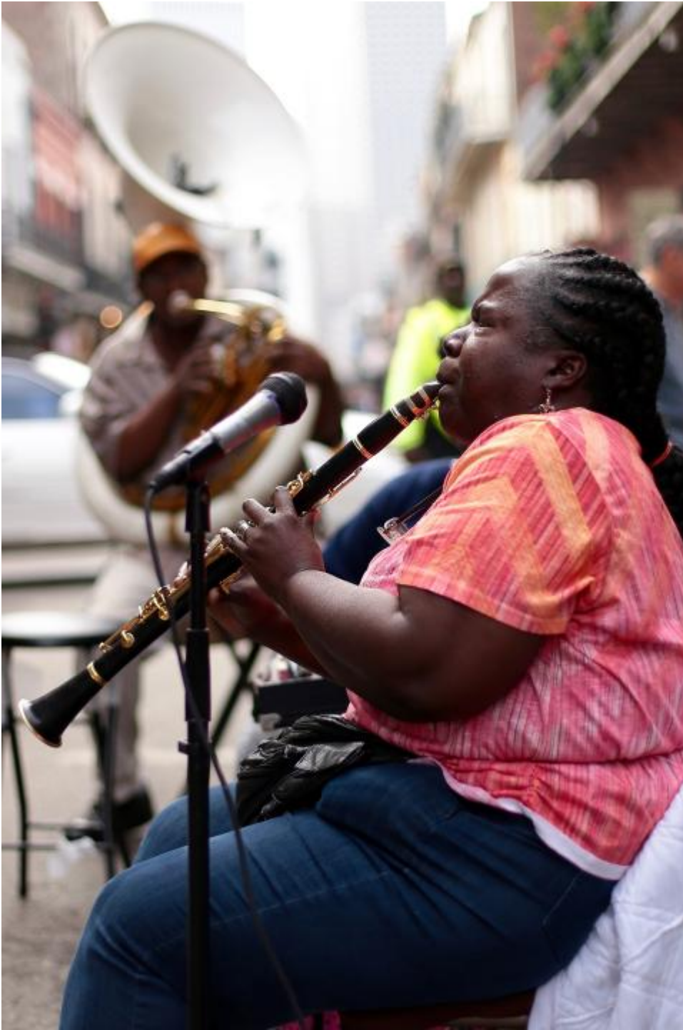
Legendary New Orleans street musician Doreen Ketchens

In hindsight, the dual track of his life is obvious: an instinct for the journalistic deep dig and an ear attuned to the soul of New Orleans.