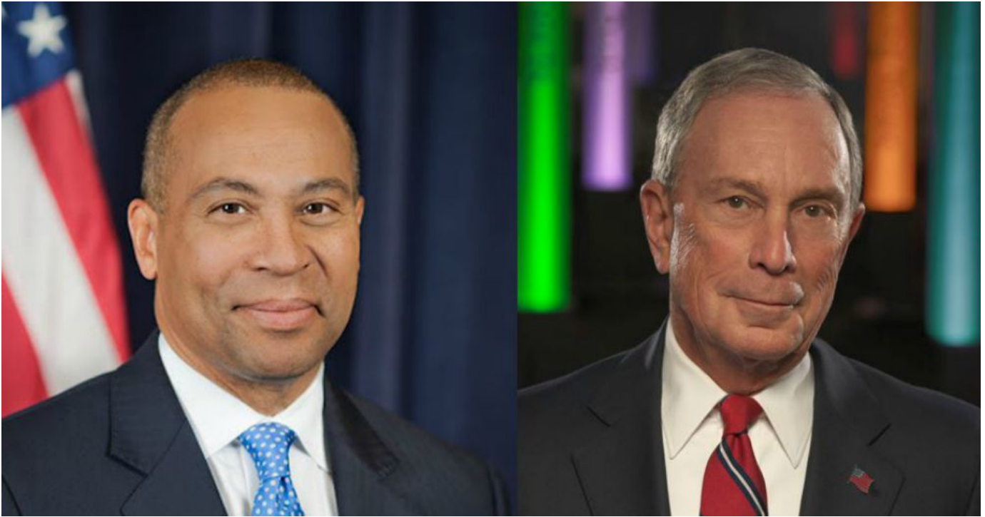
Left: Deval Patrick; right: Michael Bloomberg

Polling on Medicare for All is more complicated, and there is no denying that support for it has narrowed in recent years. The Kaiser Family Foundation has a useful report that tracks some of the polling on health care issues over time. In the PowerPoint presentation, slide No. 6 shows how important it is to speak about Medicare for All in ways that Americans like. Sixty-three percent registered a positive reaction to the phrase "Medicare for All," the same who registered support for the phrase "universal health coverage." Conversely, only 59% registered a positive reaction to the phrase "national health plan" and even less, 49%, to the phrase "single-payer health insurance system."