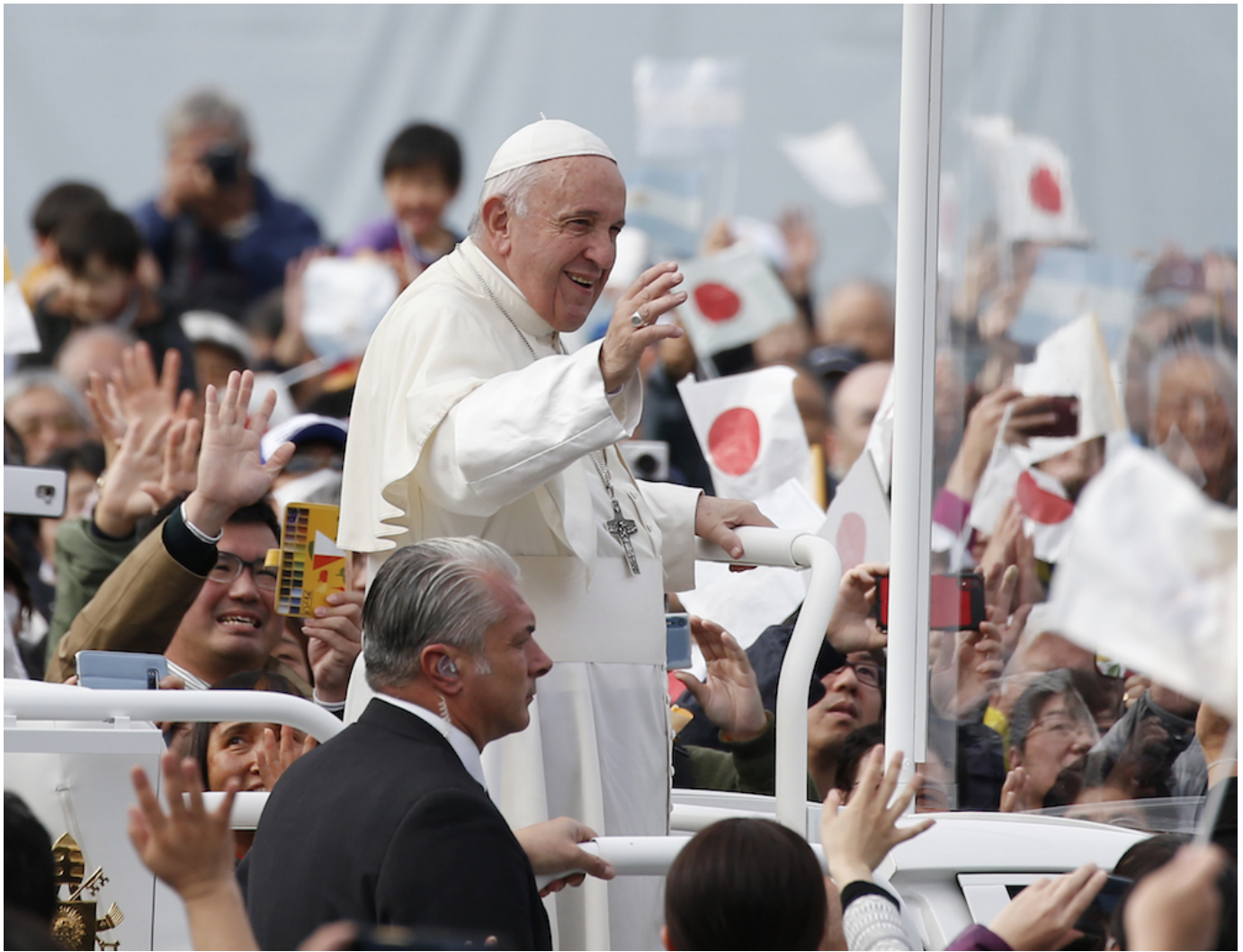
Pope Francis greets the crowd before celebrating Mass at the baseball stadium in Nagasaki, Japan, Nov. 24.

"This land has experienced, as few countries have, the destructive power of which we humans are capable," the pope said in his homily. "Nagasaki bears in its soul a wound difficult to heal, a scar born of the incomprehensible suffering endured by so many innocent victims of wars past and those of the present, when a third World War is being waged piecemeal."