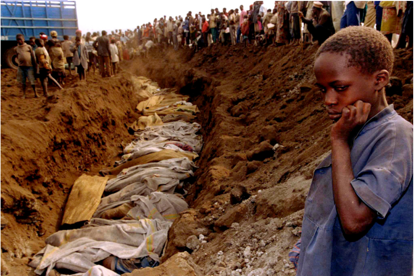
A young Rwandan stares at bodies in a mass grave July 20, 1994.