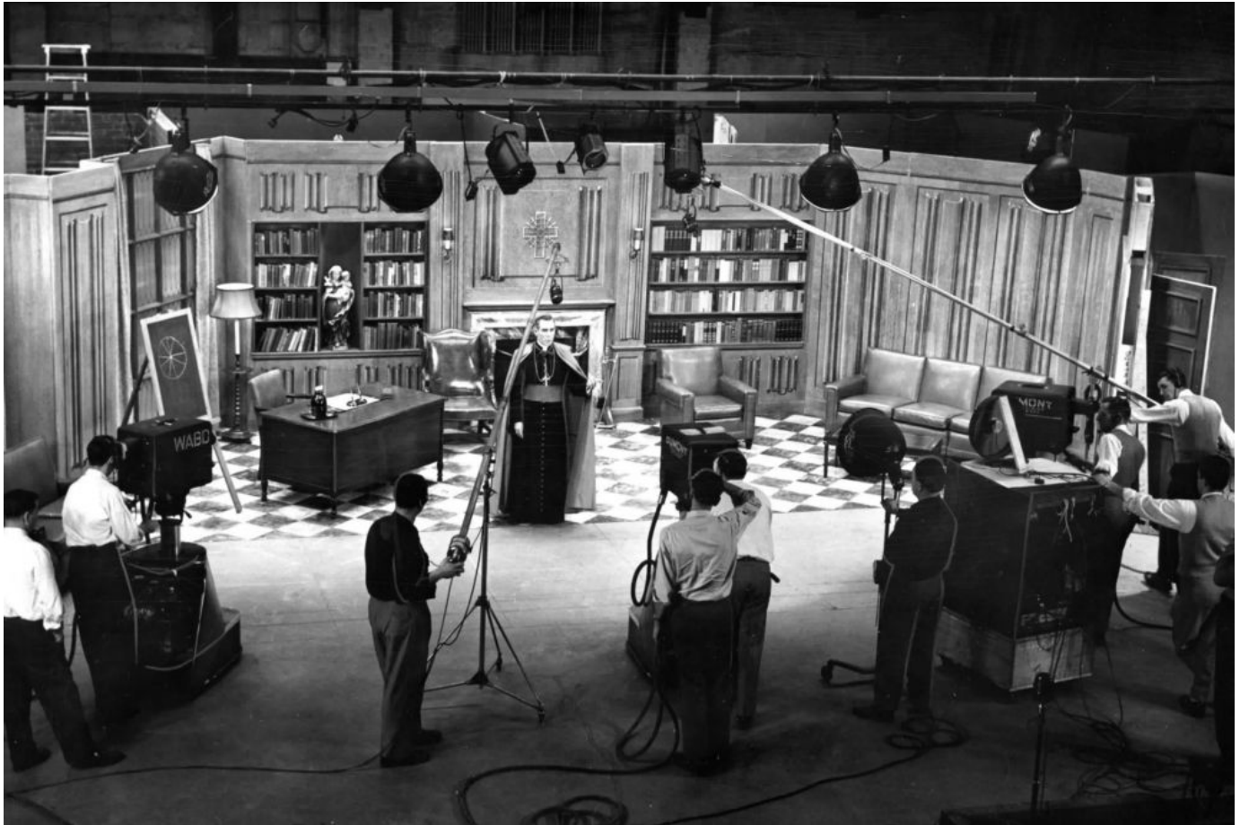
Archbishop Fulton Sheen, the famed media evangelist, mission promoter and author, is pictured in an undated photo speaking during a television broadcast.