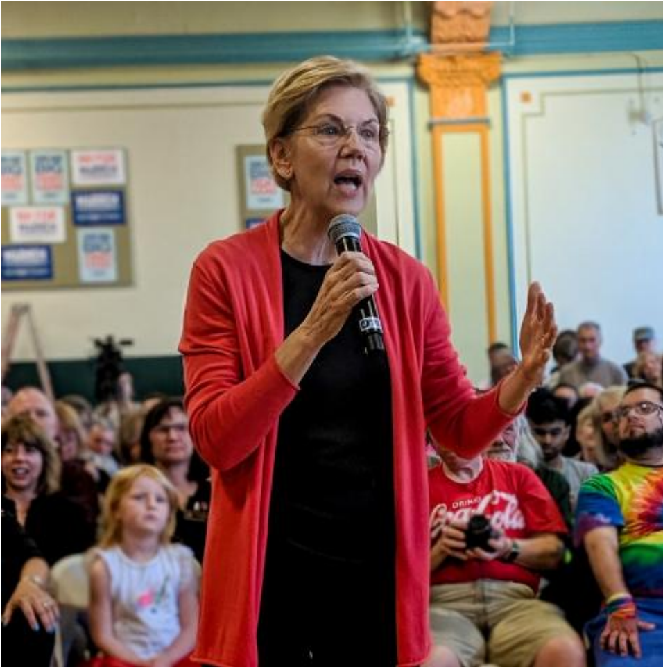
Elizabeth Warren campaigns in Nashua, New Hampshire in May 2019

This is New Hampshire, however, so even though the primary is more than three months away, and Newport seems pretty far off the beaten path, the line to attend Sen. Elizabeth Warren's town hall snakes down the sidewalk more than an hour before the event begins.