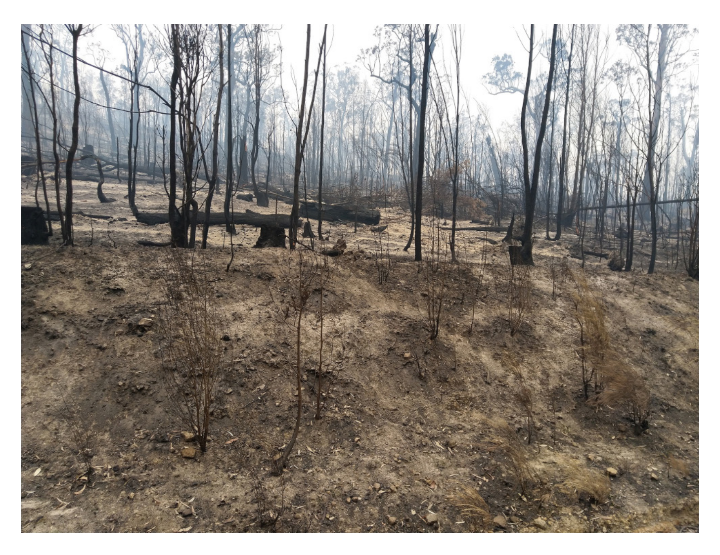
Charred trees are seen Jan. 13, 2020, following ongoing bushfires in Australia.