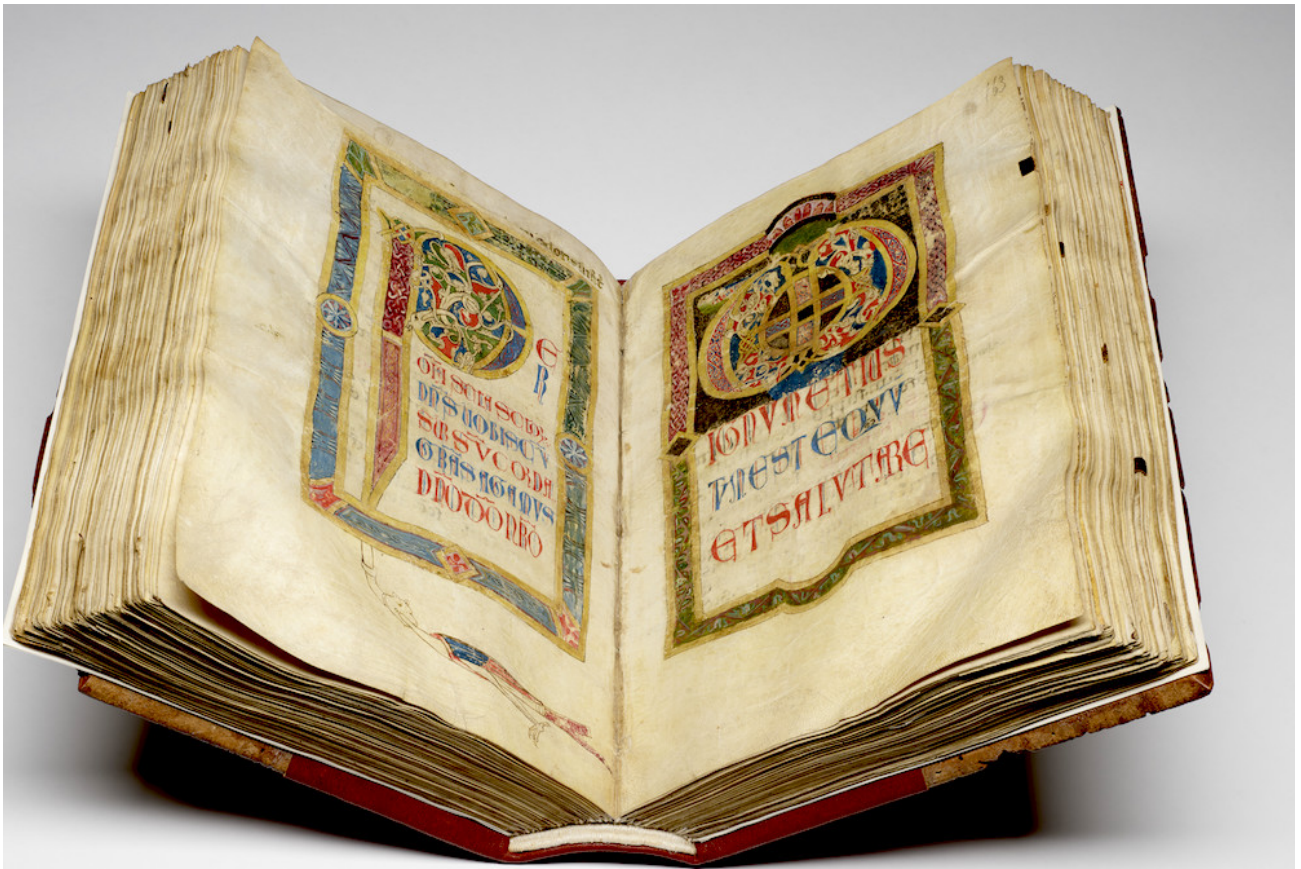
An illumination is shown from the "St. Francis Missal."

That's why this propagandist staging matters. Surely there are worse scholarly crimes than a museum stating something that had been on view at least four times in the last 40 years hadn't been shown since 1980 and trumpeting the significance of a manuscript with heavy clouds hanging over it. But in the era of deep-fake videos and news, it's disturbing that curators decided to sweep this theological quandary under the museum carpet.