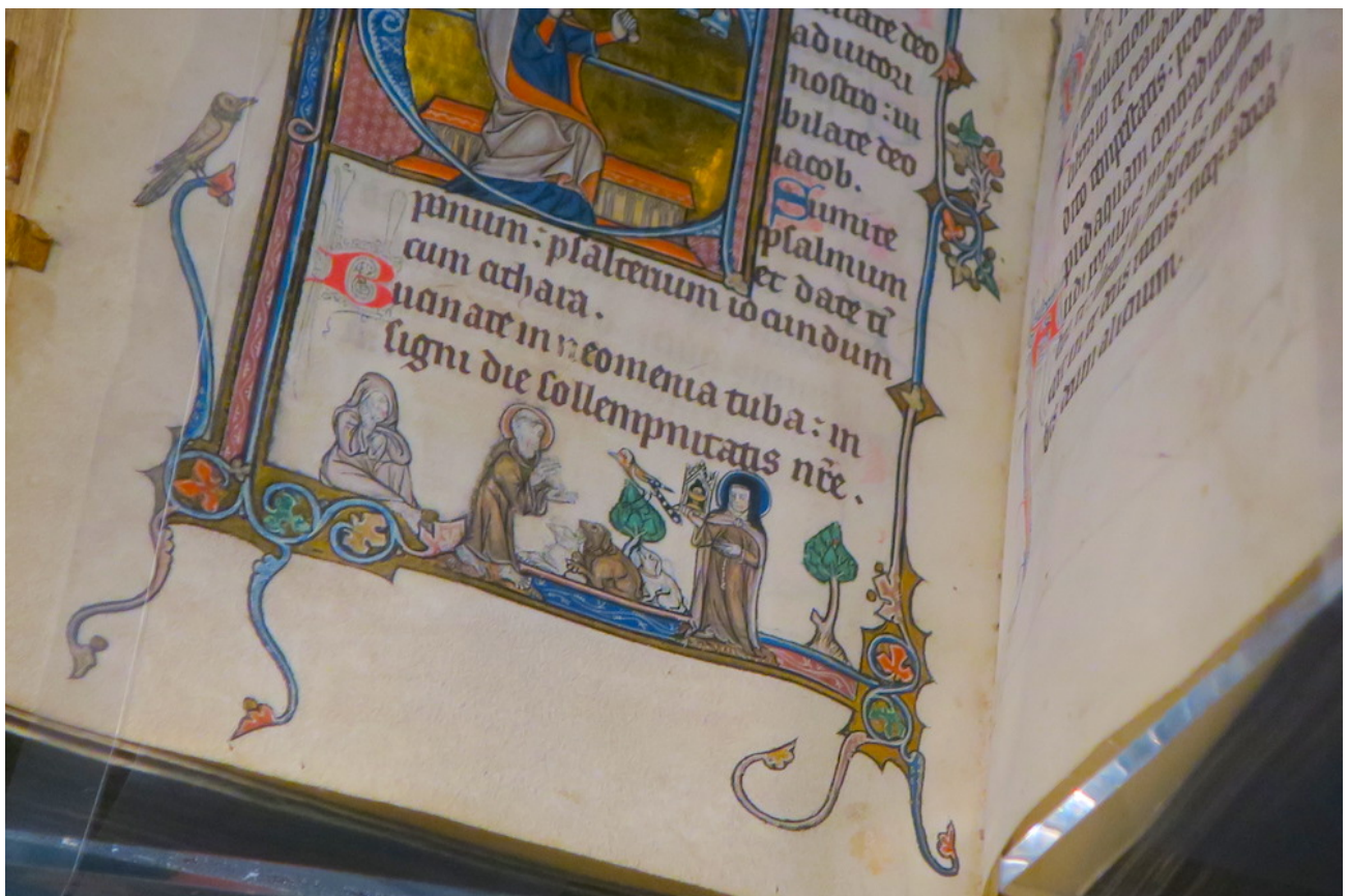
Detail of a circa 1275-1300 French psalter (and office of the dead) depicting St. Francis preaching to the animals and St. Clare holding a monstrance, on view