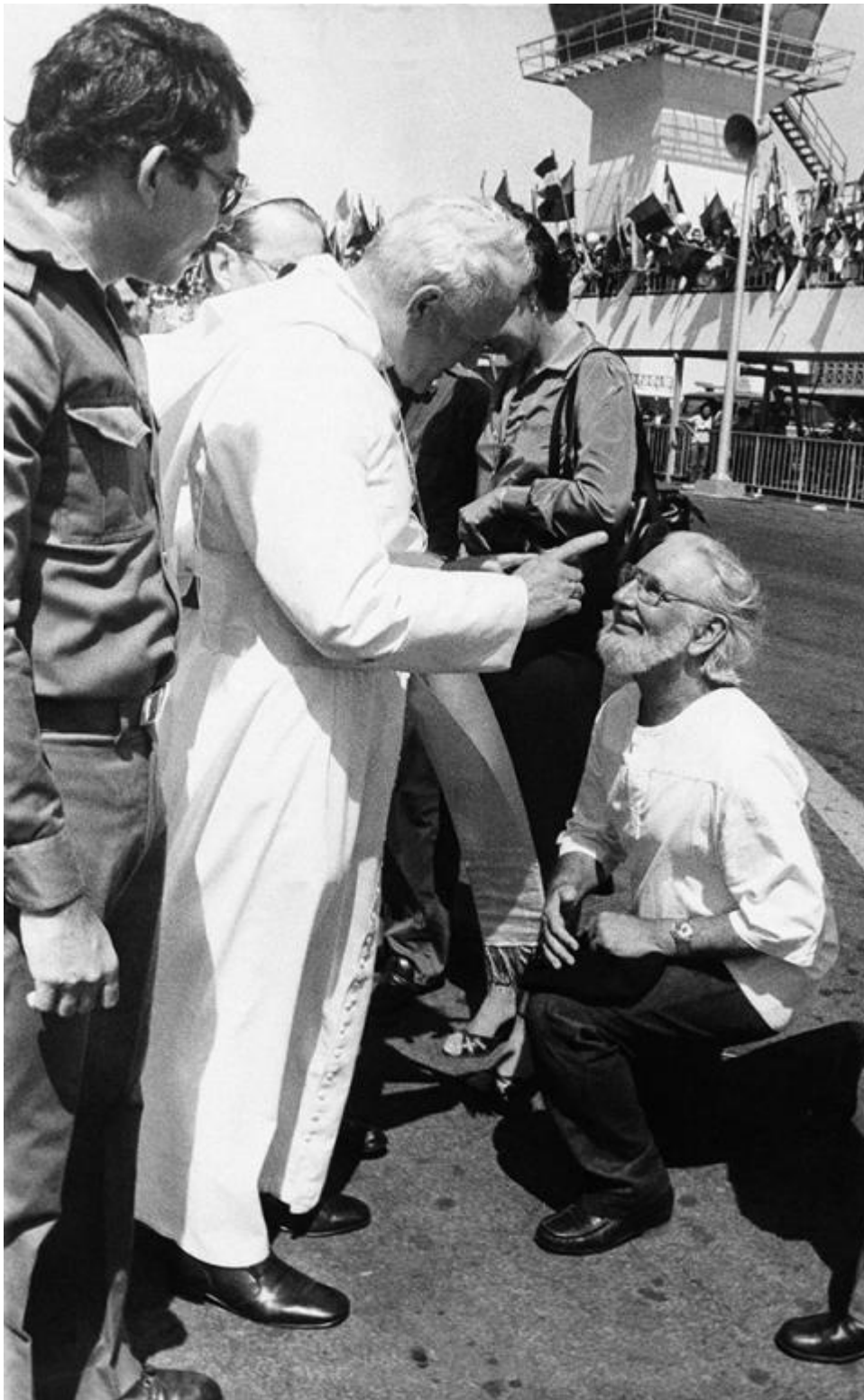
In this March 4, 1983 file photo, Daniel Ortega flanks Pope John Paul II who wags his finger at Culture Minister and priest Ernesto Cardenal, during welcoming ceremonies at the airport in Managua, Nicaragua.