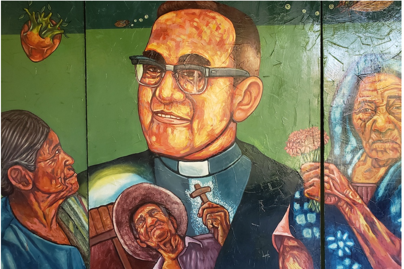
This painting of Óscar Romero is at a museum dedicated to peace in the town of Suchitoto, El Salvador.