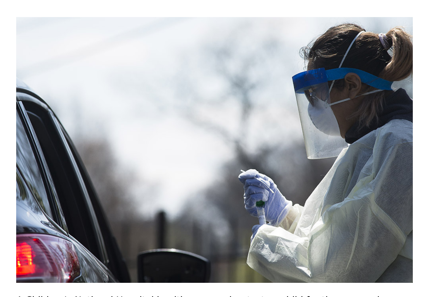
A Children's National Hospital health care worker tests a child for the coronavirus March 26 at a drive-thru testing station located at Trinity Washington University in Washington.

I saw an ad on CNN, a typical political ad with a disembodied voiceover, dark music, clearly an attack ad, and it had a mistake in the middle of it permitting the Trump campaign to attack it as false. The mistake was minor, but real. The more important problem was that the ad lacked the power of "Trump's Coronavirus Calendar" to which I called attention earlier. The calendar video was entirely in the president's own words. The viewer can be 20 or 25 seconds into it before realizing it is an attack ad. It would be far more effective than the standard negative ad now being shown. Unless the Democrats reach that 10% who do not have a strong feeling about Trump and make sure they grasp how his failed response has made this crisis much, much worse, they will lose in November. Punto. Harkening back to how President Barack Obama handled the Ebola crisis, or how other countries are handling the coronavirus crisis, neither of these approaches will work with people who do not pay a lot of attention to politics.