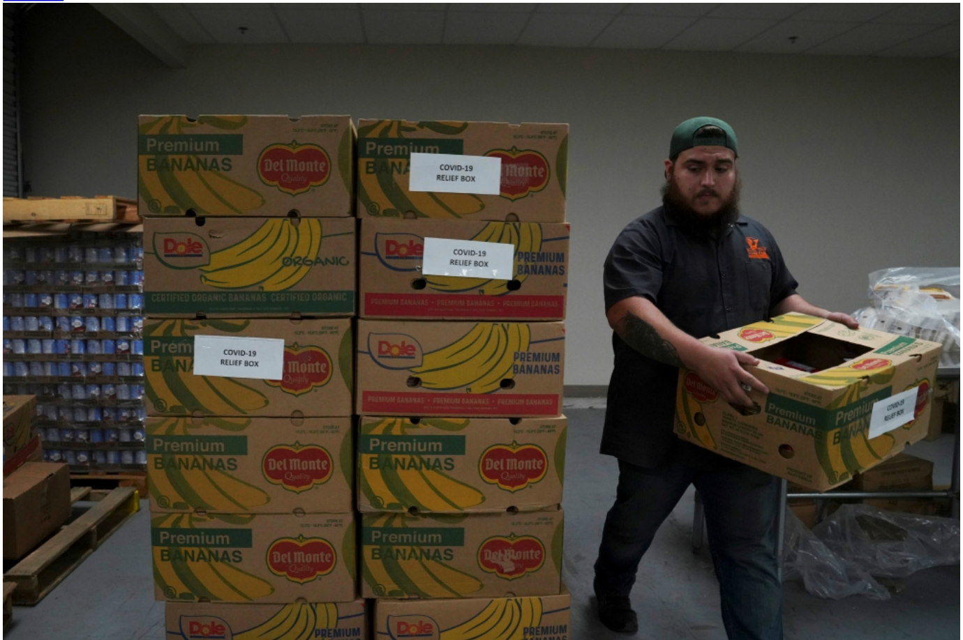
A man in Laredo, Texas, stacks relief boxes at the South Texas Food Bank March 20 during the coronavirus outbreak.