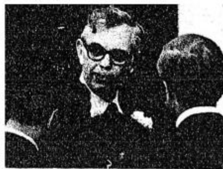
GILBERT GUDE (R-MD.), keynote speaker for "Earth Day" here on campus as he entered McFaban auditorium before his speech. The speech followed the "Action Mass" and preceded other events scheduled on campus in connection with the day.

to people with the sense to see the dangers of pollution and the discipline to do something about it."