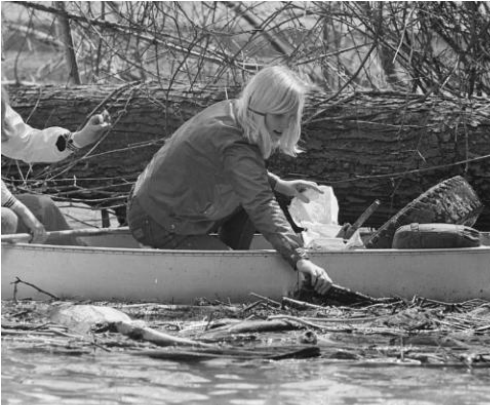
A Girl Scout in a canoe picks trash out of the Potomac River during Earth Week in April 1970.