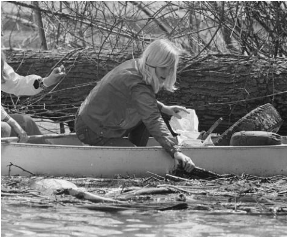
A Girl Scout in a canoe picks trash out of the Potomac River during Earth Week in April 1970.

An estimated 20 million Americans took part in that first Earth Day, representing at the time one-tenth of the U.S. population. Scattered among them were many Catholics and people of faith. The staff coordinating Earth Day encouraged local organizers to reach out to the faith community, well aware of the "huge role" they played in launching the civil rights and anti-war movements, recalled Denis Hayes, who was in 1970 the 25-year-old Harvard graduate student Nelson appointed as national organizer.