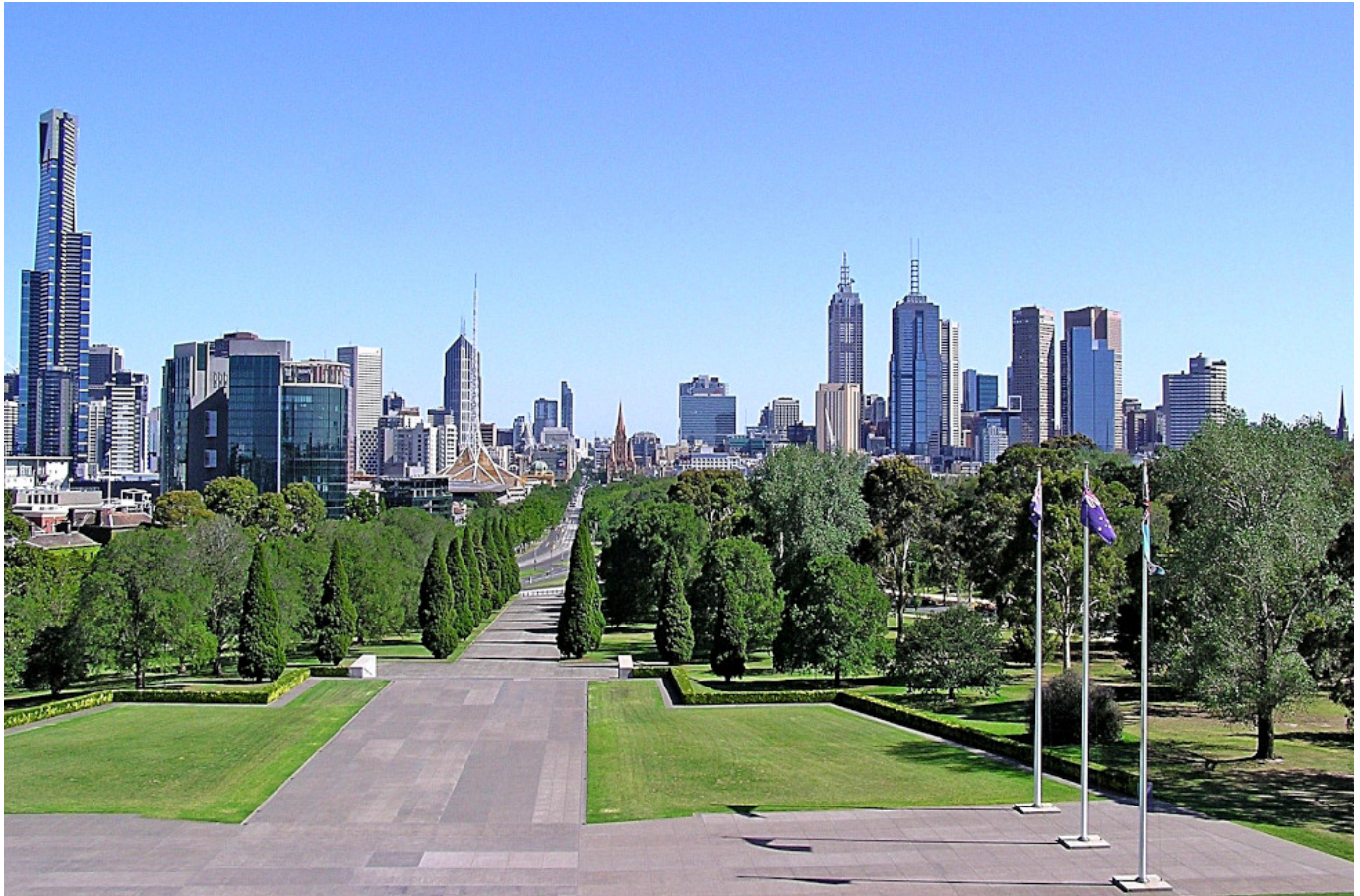
Shrine of Remembrance, Melbourne, Australia.