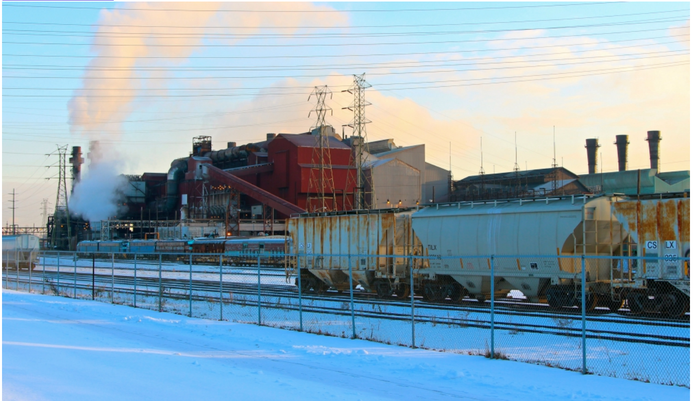
View of the ArcelorMittal steel mill in Cleveland, 2016