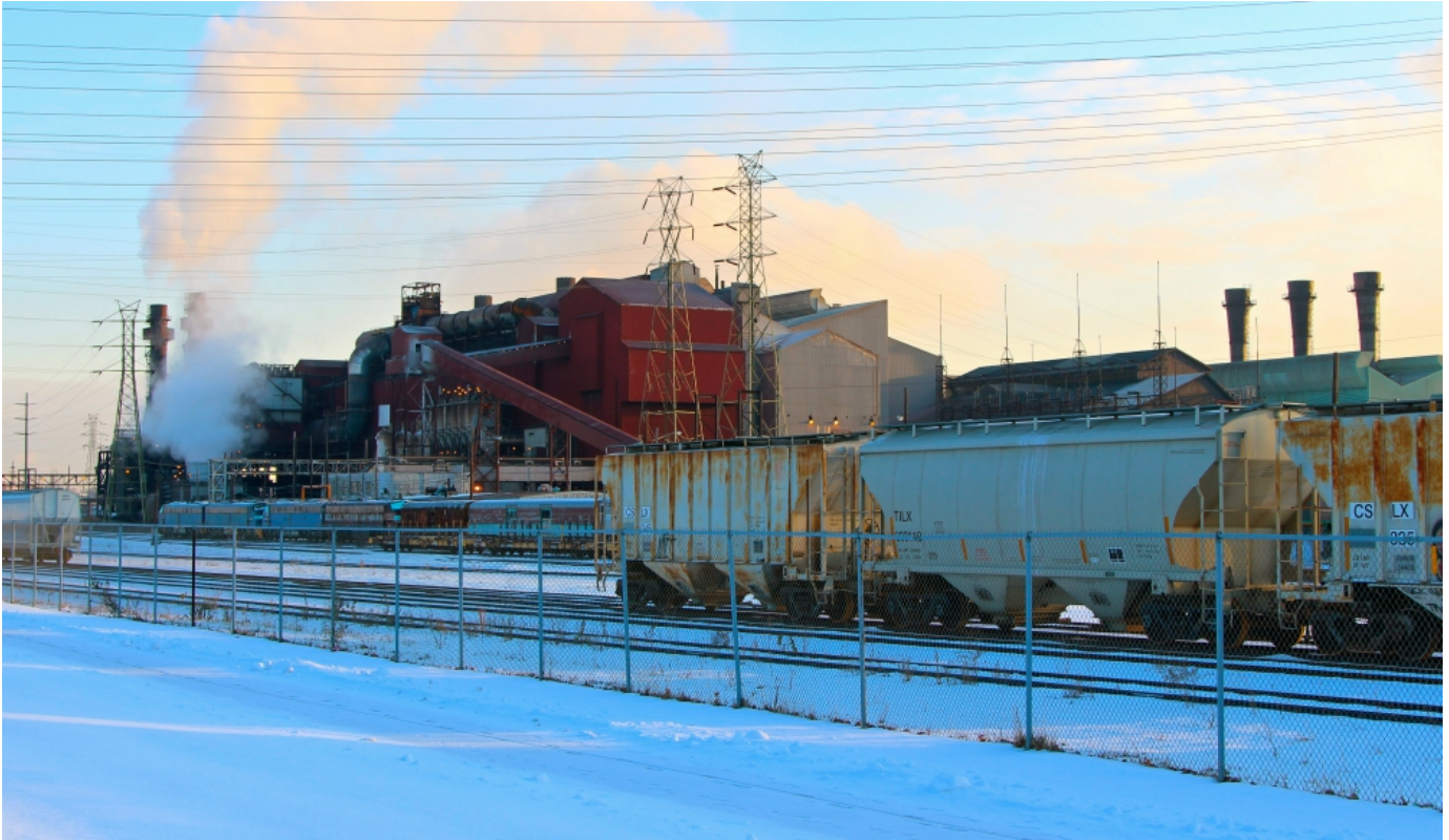
View of the ArcelorMittal steel mill in Cleveland, 2016