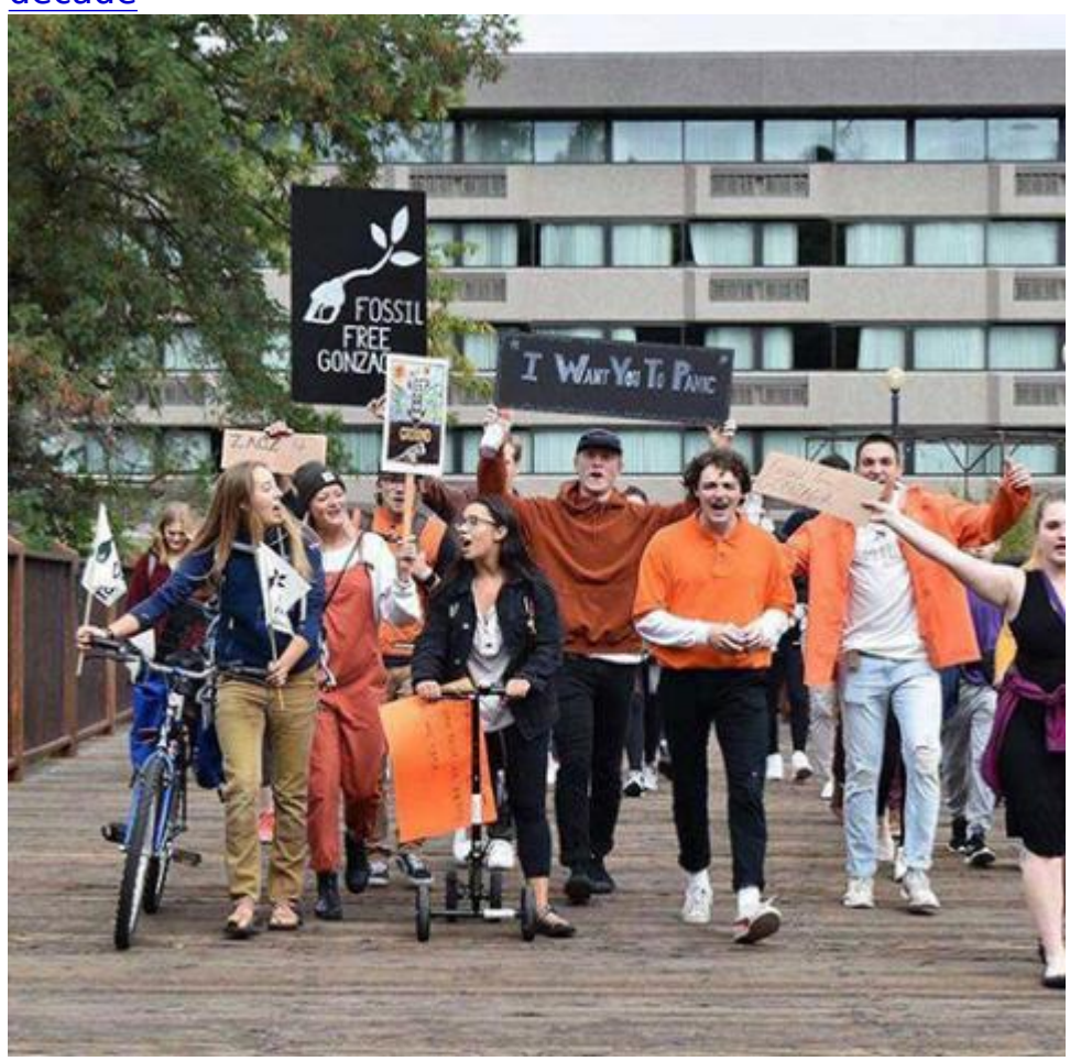
Related: Vatican office invites church on journey to 'total sustainability' in next decade

Students at Gonzaga University demonstrate during the September 2019 Climate Strike