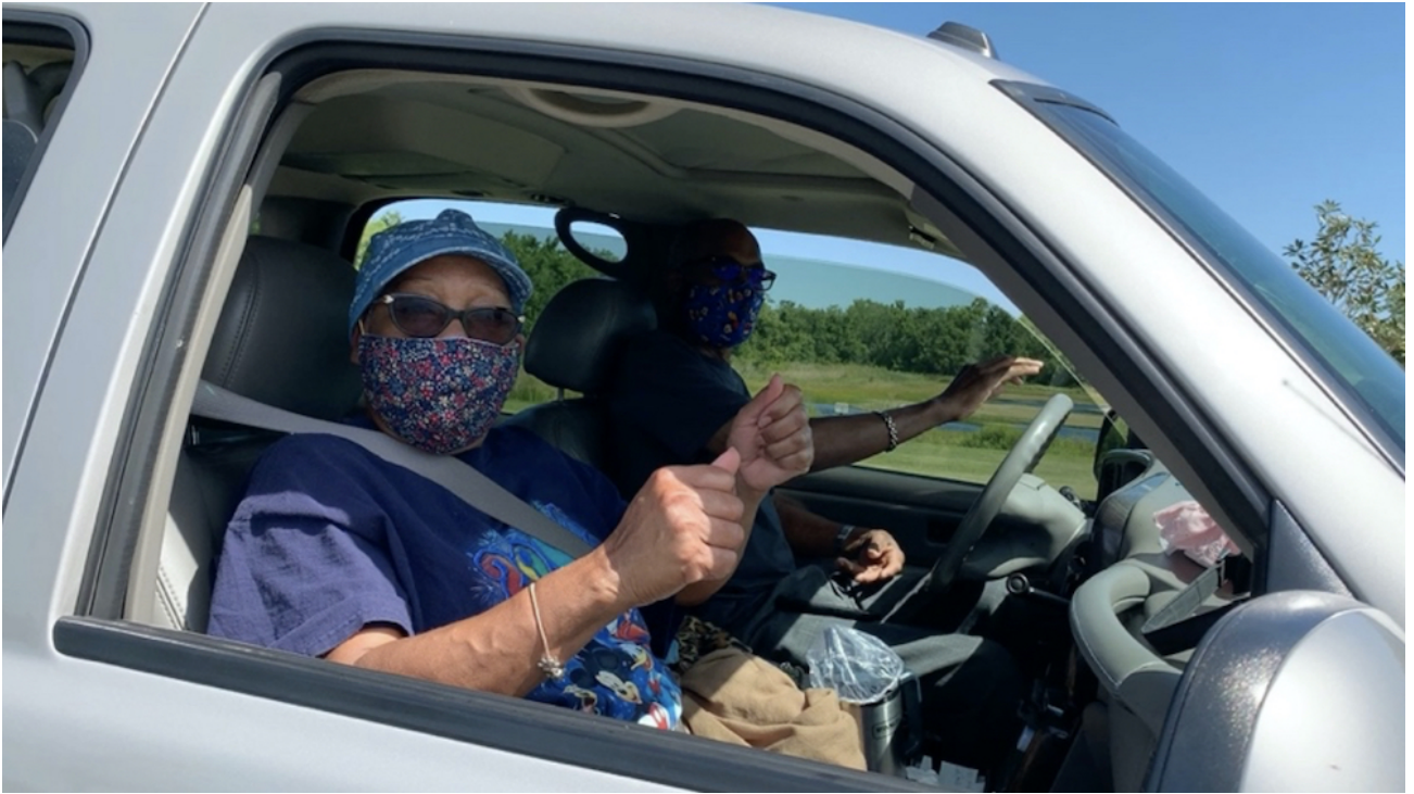
Two people who worked in transportation, bus driving, for a Disney park came to St. Rose of Lima food pantry May 8.