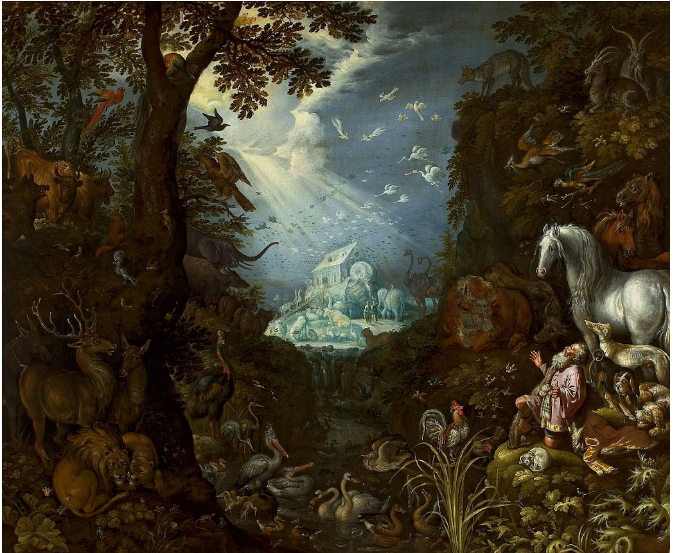
Noah's Ark by Roelant Savery