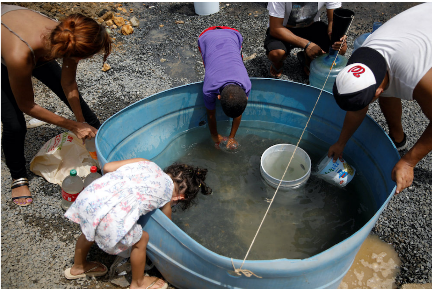
Displaced people fill containers with water Sept. 26, 2017, in Canovanas, Puerto Rico, in the aftermath of Hurricane Maria.

And the latest poll shows that 80% of Americans feel that this country is out of control. We need to get back control of our country, and what we stand for. America is a great country and we have to make sure that we live up to that creed, that north star that we want to be the best America that we can. And I think that is what we should be shooting for as we mobilize and organize and educate, to transform this country to become the best that it can be.