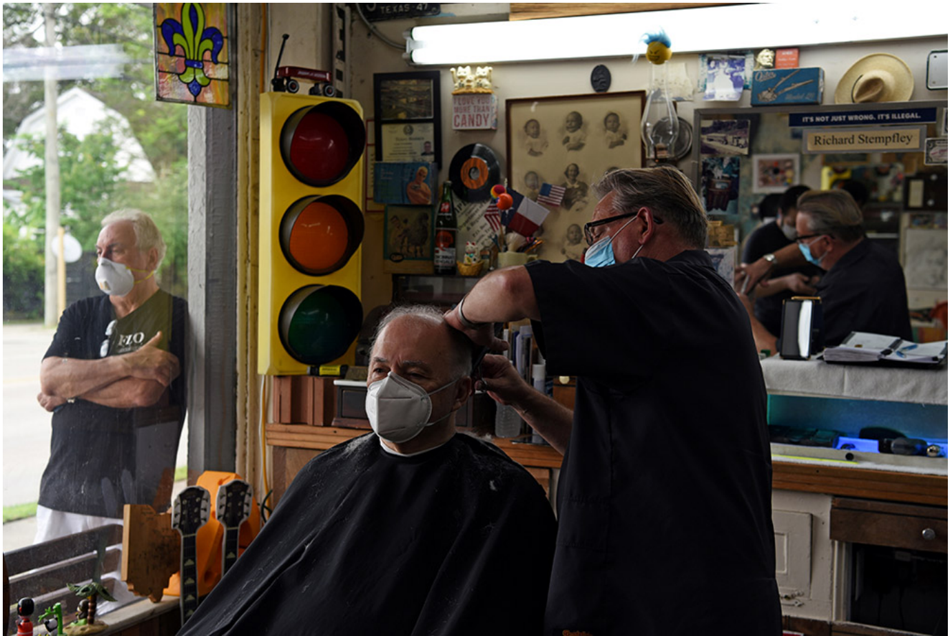
A man in Houston receives a haircut as social distancing guidelines are relaxed May 8 during the coronavirus pandemic.