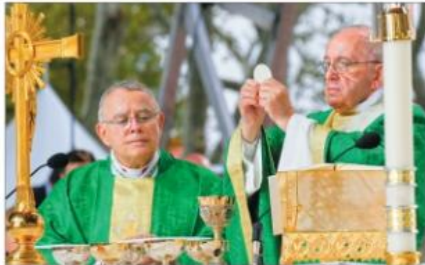
Pope Francis, right, receives the Eucharist as he celebrates the closing Mass of the World Meeting of Families in Philadelphia in 2015. With him at the altar is Philadelphia Archbishop Charles Chaput.