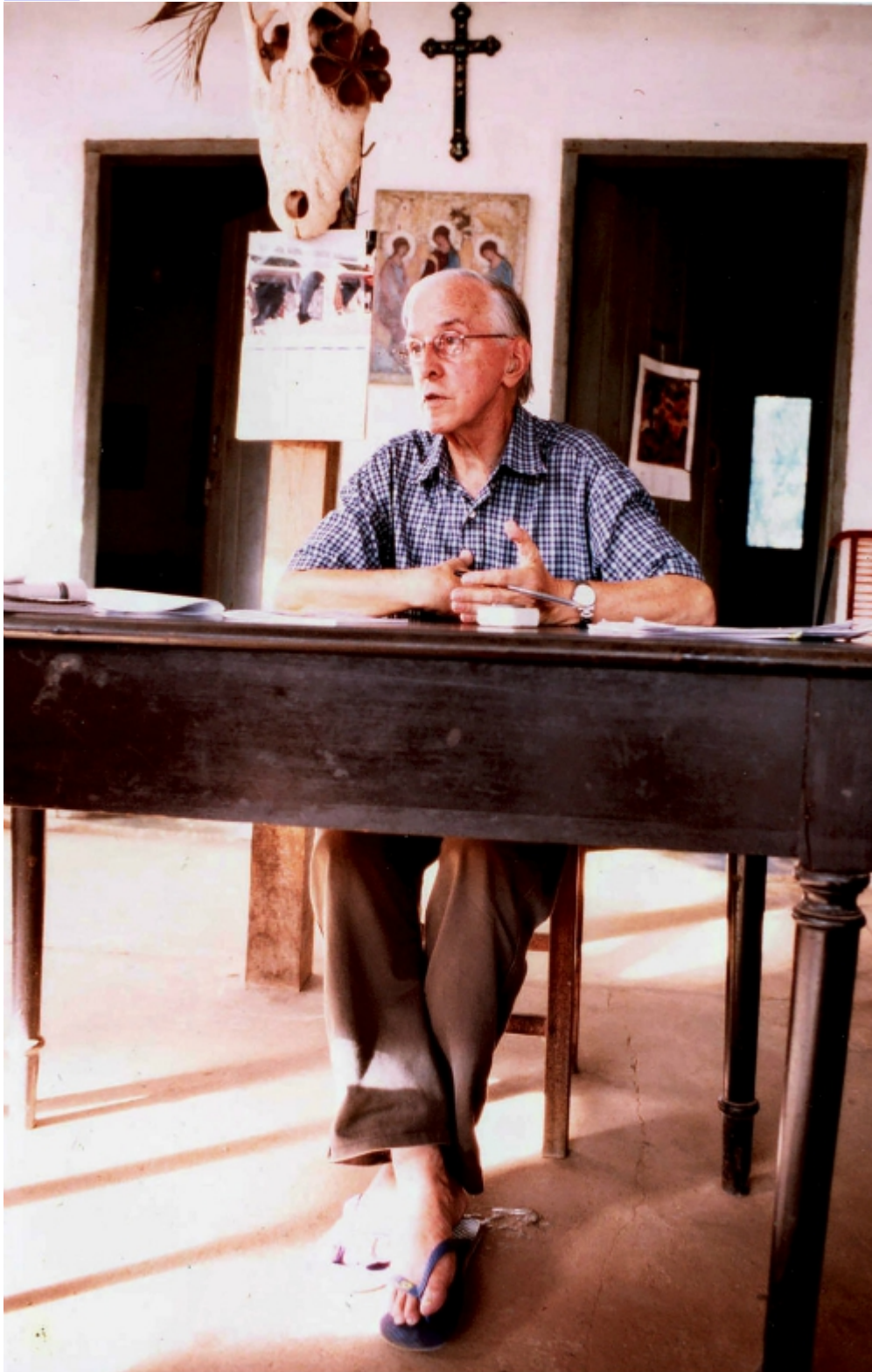
Retired Bishop Pedro Casaldáliga in an undated photo.