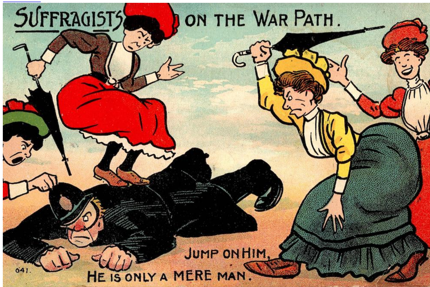
Anti-suffrage postcard