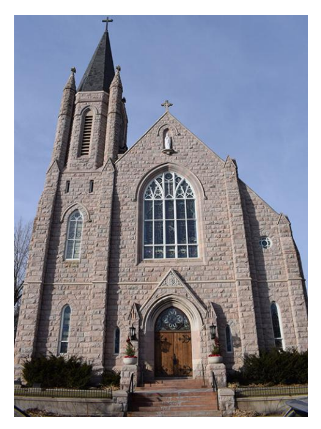
Sacred Heart Church sits in the neighborhood of 22nd and Binney Streets.

The parish began as an Irish Catholic parish, where statues of St. Bridget and St. Patrick can be found on either side of Christ on the altar. And though the parish is welcoming to all peoples, it did have a history of racism.