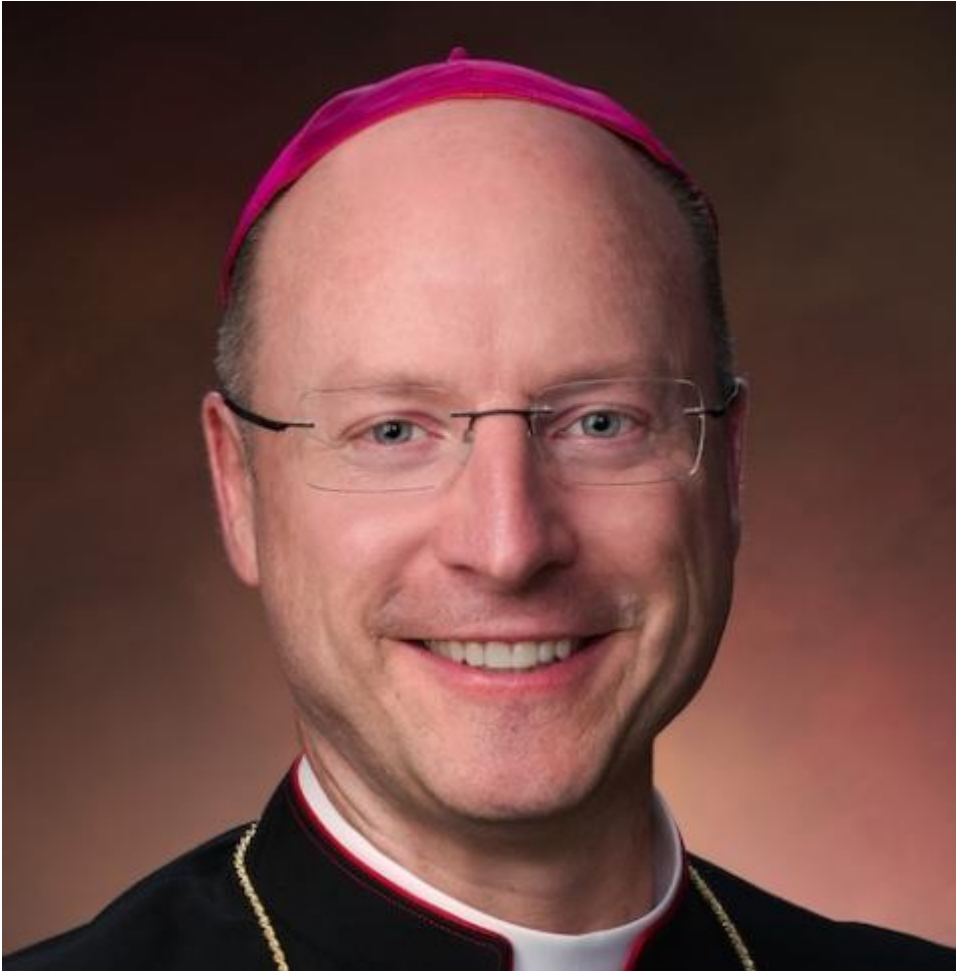
Bishop Shawn McKnight of Jefferson City, Missouri

"When priests come in from another country, they are priests. They are trained in Catholic theology like everyone [priests in the U.S.] but it is a different culture. It is a different ecclesial context," Okure said.