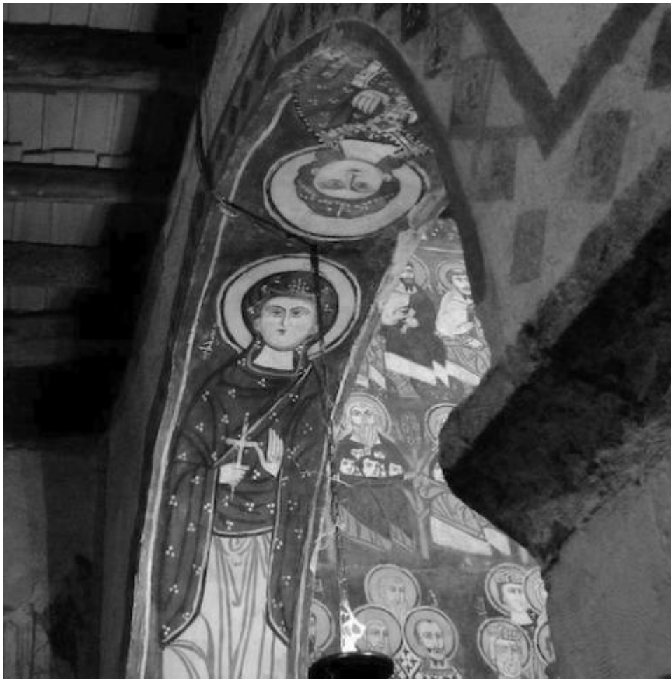
Southwest arch and west wall of the Deir Mar Musa al Habashi church