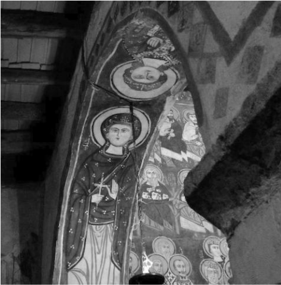
Southwest arch and west wall of the Deir Mar Musa al Habashi church