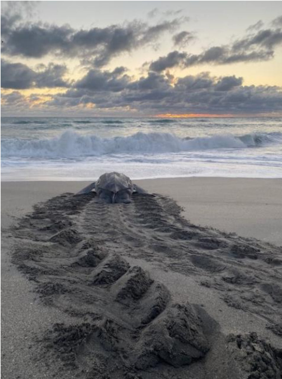
A leatherback sea turtle, " Dermochelys coriacea ," returns to the water after nesting, May 7, 2014

clutch of eggs. They would carefully check the nest and erect the orange plastic tape "fence" around it with stakes bearing a code for each species — not to be revealed lest poachers figure it out — and signs warning against disturbing the nests. Penalties under Florida law can include 60 days in jail and a $500 fine, plus an additional $100 for each egg destroyed or taken. The federal Endangered Species Act allows sanctions of up to a year in prison, civil fines of $25,000 or criminal penalties of $100,000.