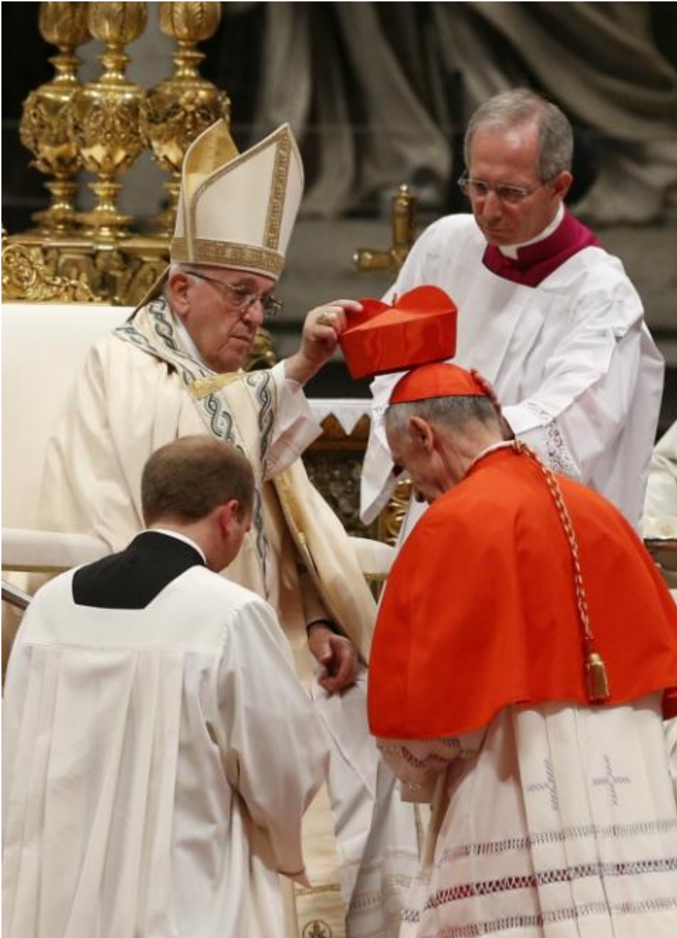
New Cardinal Luis Ladaria, prefect of the Congregation for the Doctrine of the Faith, receives his red biretta from Pope Francis during a consistory to create 14 new cardinals in St. Peter's Basilica at the Vatican June 28, 2018.

In cases involving persons who are members of religious communities, the congregation typically only corresponds with the person's religious superior.