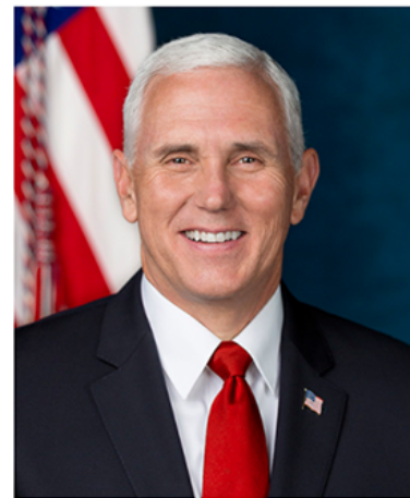
Mike Pence RLM-PAC Endorsed for U.S. Vice President Where the Vice Presidential Candidates Stand Factsheet

The endorsements page of the Right to Life of Michigan website (NCR screenshot/Rtl.org)