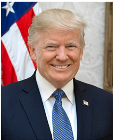
Donald Trump RLM-PAC Endorsed for U.S. President Where the Presidential Candidates Stand Factsheet

"The road to the White House leads directly through Michigan," he told attendees.