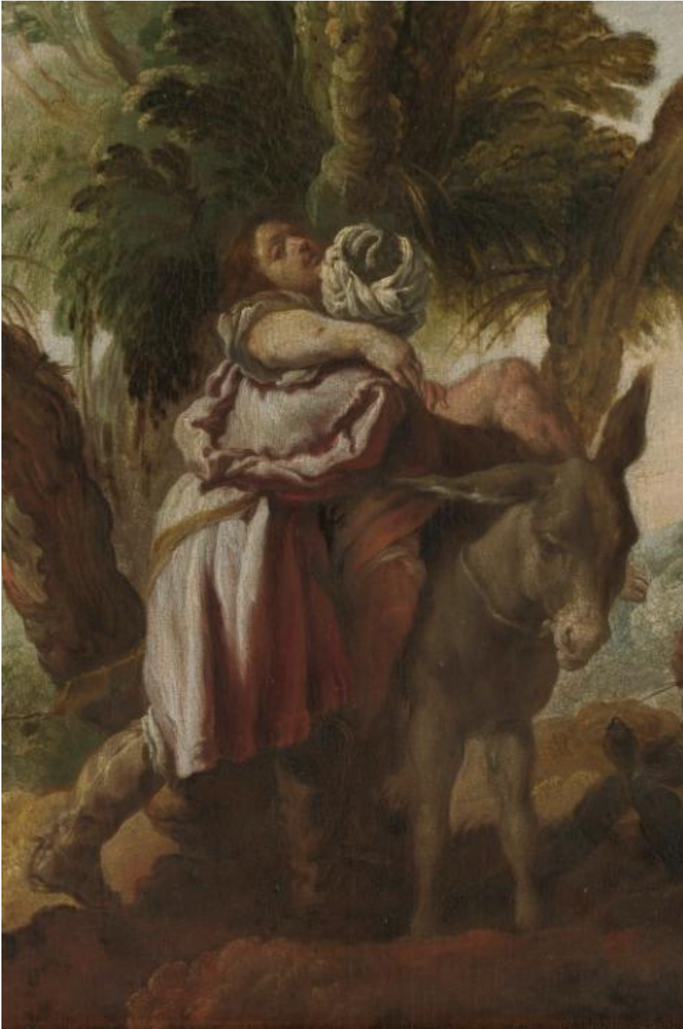
"The Good Samaritan" (circa 1618-22, detail), attributed to Domenico Fetti (Metropolitan Museum of Art)

The parable of the good Samaritan provides an alternative. It lays out clear, positive moral obligations to our neighbor, including those who, in one way or another, are