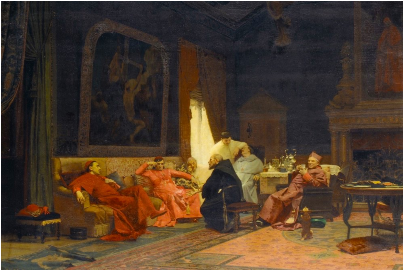
Detail of painting "The Missionary's Adventures" by Jean-Georges Vibert. circa 1883 (Metropolitan Museum of Art)