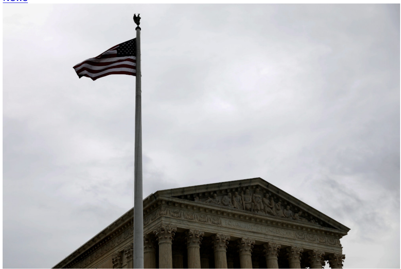
The U.S. Supreme Court is temporarily allowing drugs used to medically induce abortions to be mailed or delivered without requiring the recipient to make a doctor's visit during the coronavirus pandemic.