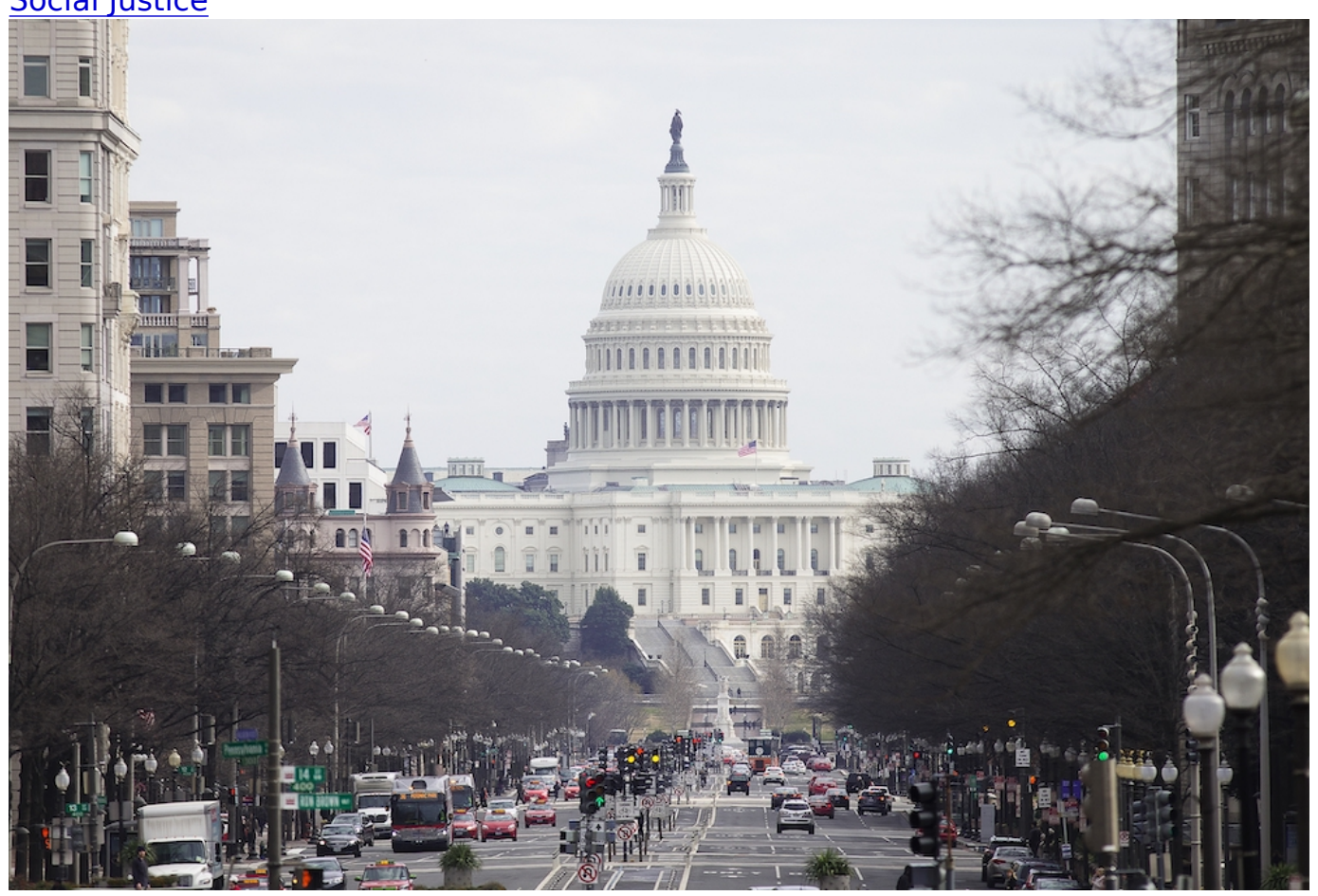
U.S. Capitol, Washington, D.C., Jan. 8, 2019