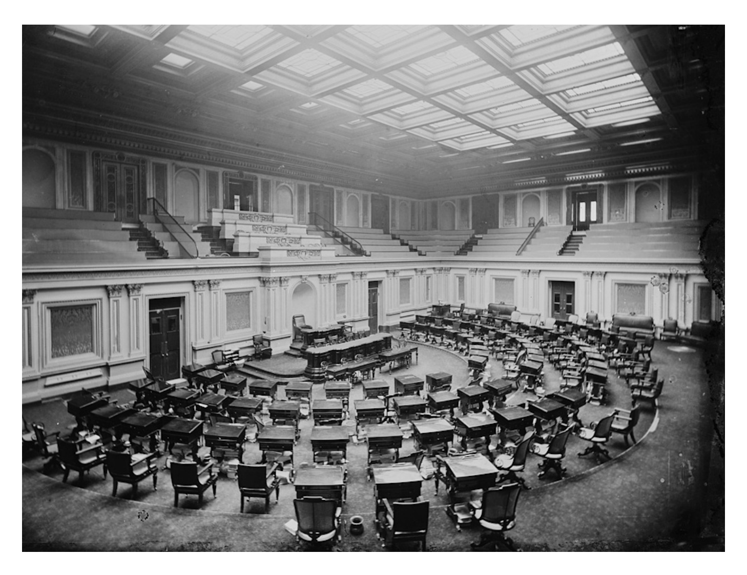
Senate chamber, U.S. Capitol, circa 1873

As we sank lower and lower in political and national character, I began to see that we had managed in the process to make Jesus harmless, made him marshmallow, made him sweetness and light in a world where the poor were going hungry. Where both young and old were out of work. Where in the richest country in the world, hard-working people were living on minimum wages rather than living wages, were too poor to get sick while huge tax cuts (primarily benefitting the wealthy and large corporate business interests) trimmed the social budget thinner and thinner.