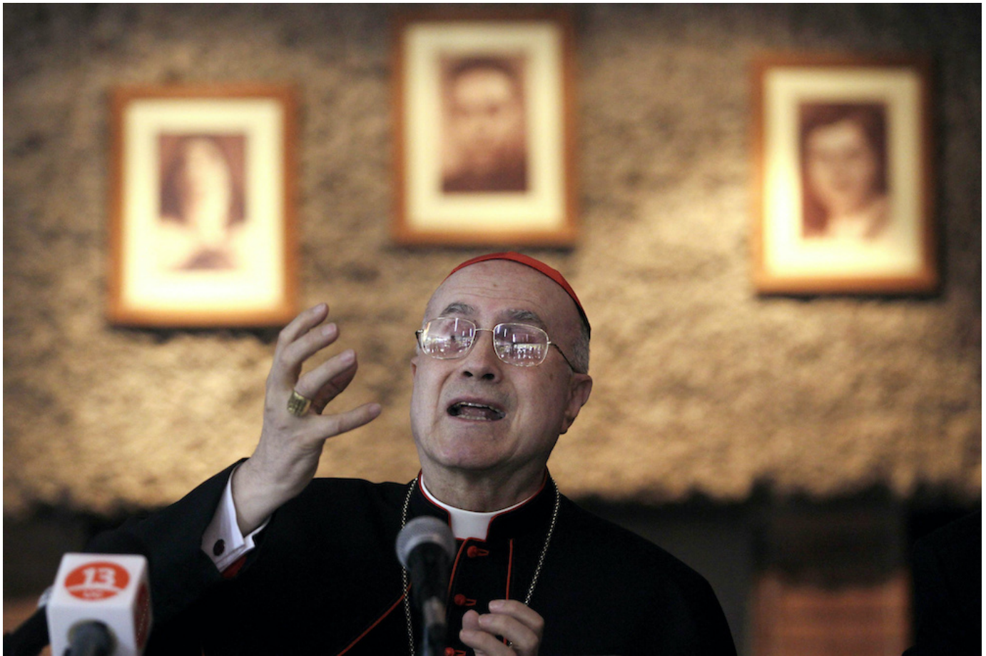
Cardinal Tarcisio Bertone, then-Vatican secretary of state, gestures during a news conference in Santiago, Chile, April 12, 2010.