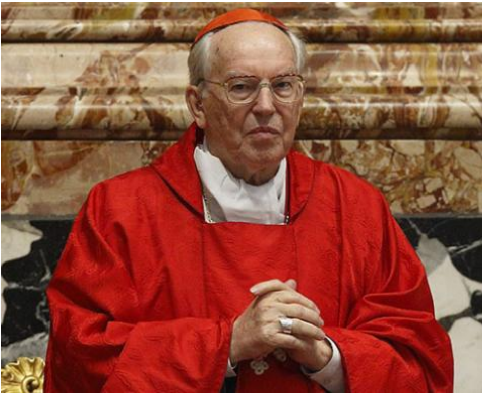
Cardinal Giovanni Battista Re, now dean of the College of Cardinals, in a 2019 photo

"Ultimately, the path of a canonical process to resolve factual issues and possibly prescribe canonical penalties was not taken," states the summary. "Instead, the decision was made to appeal to McCarrick's conscience and ecclesial spirit by indicating to him that he should maintain a lower profile and minimize travel for the good of the Church."