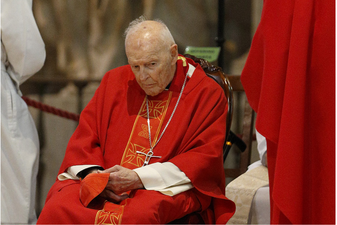
Then-Cardinal Theodore McCarrick attends a Mass April 11, 2018, in Rome.