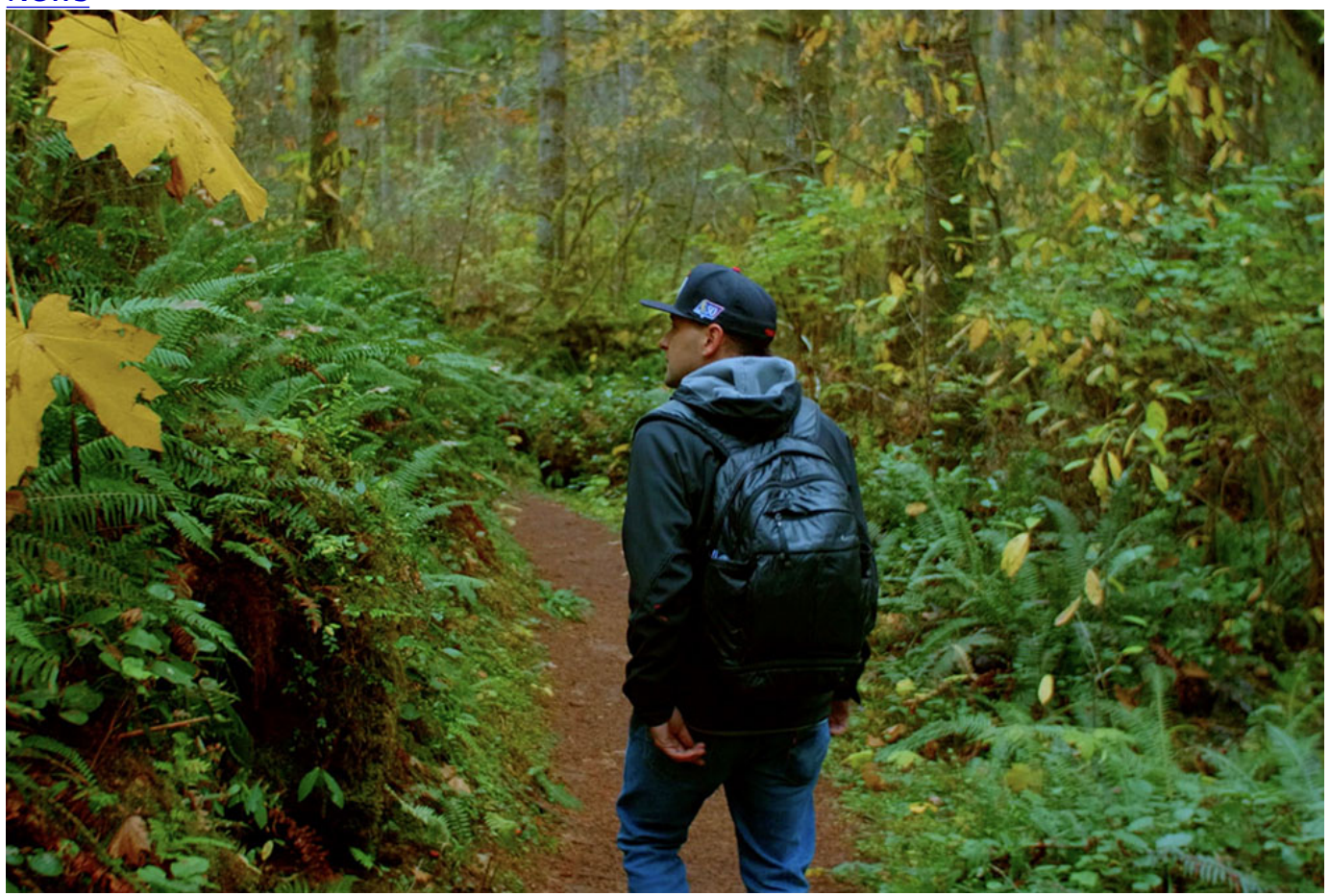
A still from Sky Hopkina's film "małni – towards the ocean, towards the shore"