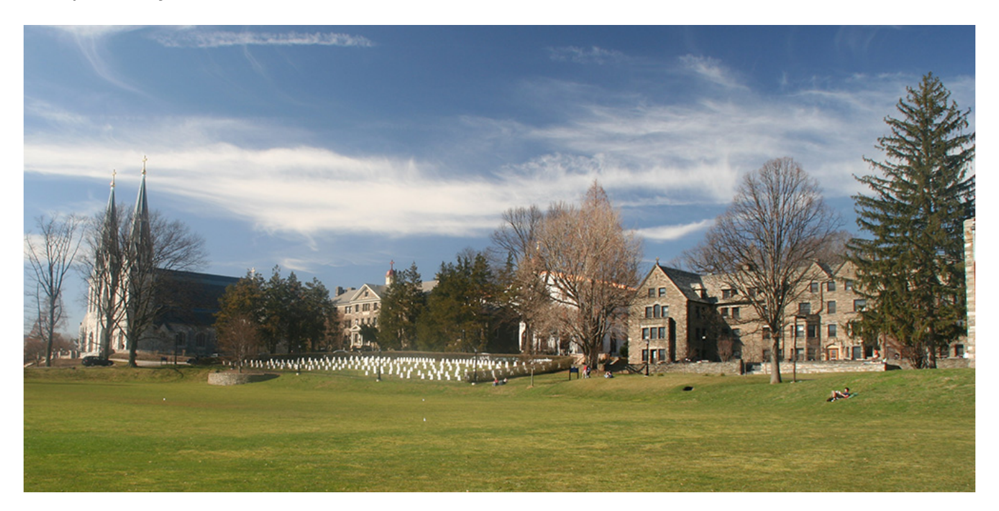
Villanova University's campus is seen in a 2010 photo.

Villanova added <u>armed its police in 2016</u>, despite student protests against the move and despite relatively <u>low levels of violence</u> in the suburban community surrounding campus, Lloyd said.